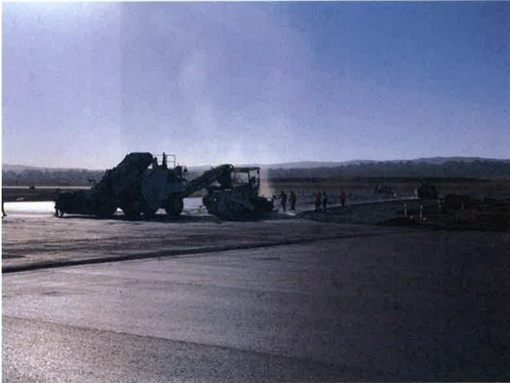
The AC paving from the TWY Delta connection to new TWY Foxtrot is now complete. Lights now need to be installed, line marking applied and flank works completed.