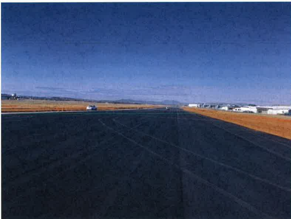
The AGL trenches and pits are all but complete, with AC now to be applied over the top.