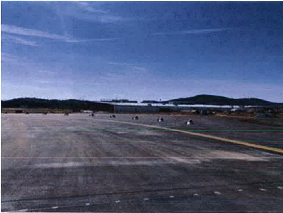
Delta/Bravo intersection works (Dec 2019)