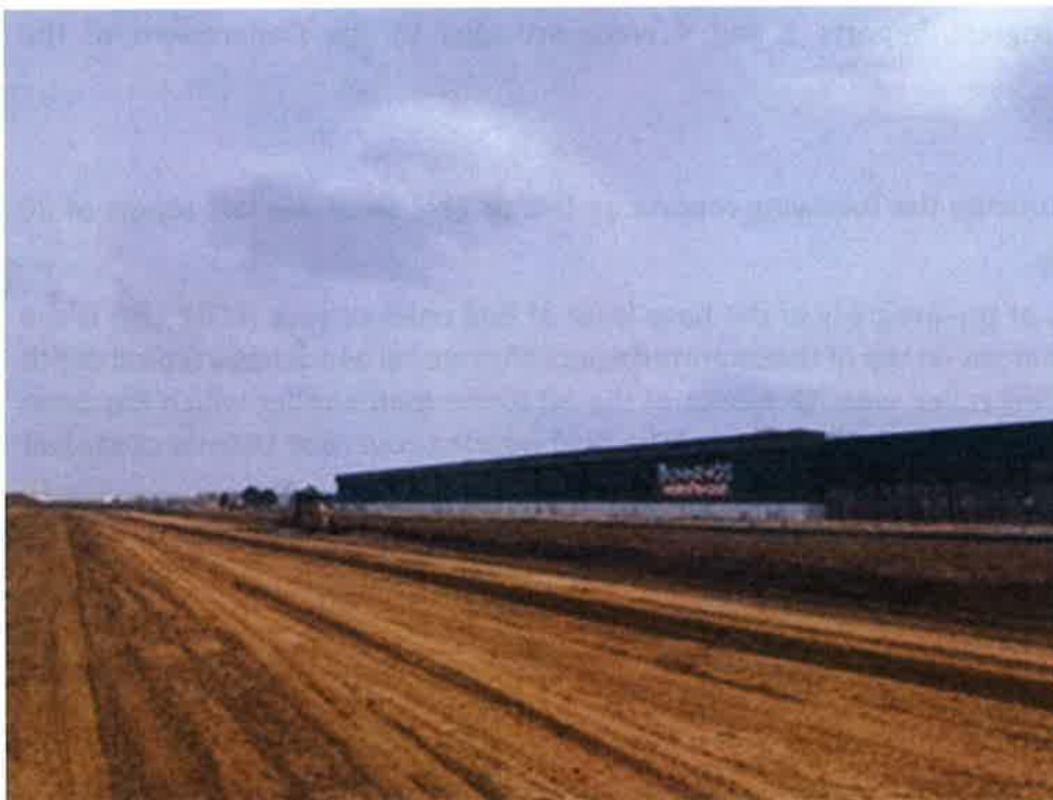
Northern section of TWY B aligned with Bunnings (Dec 2019)