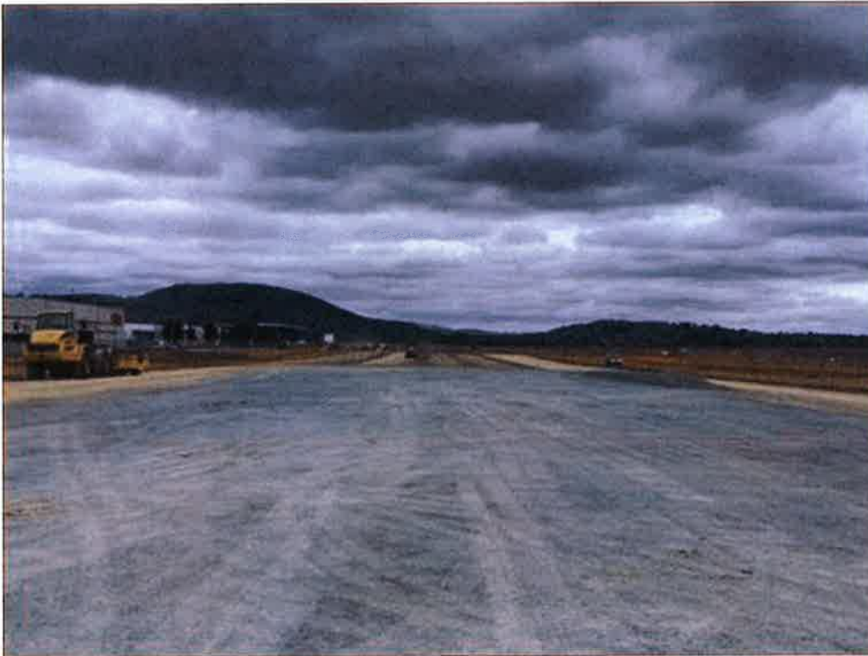
North of finished level (Feb 2020)