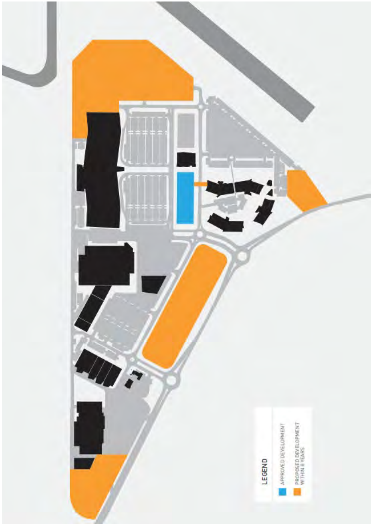
Figure 8.4 - Majura Park precinct