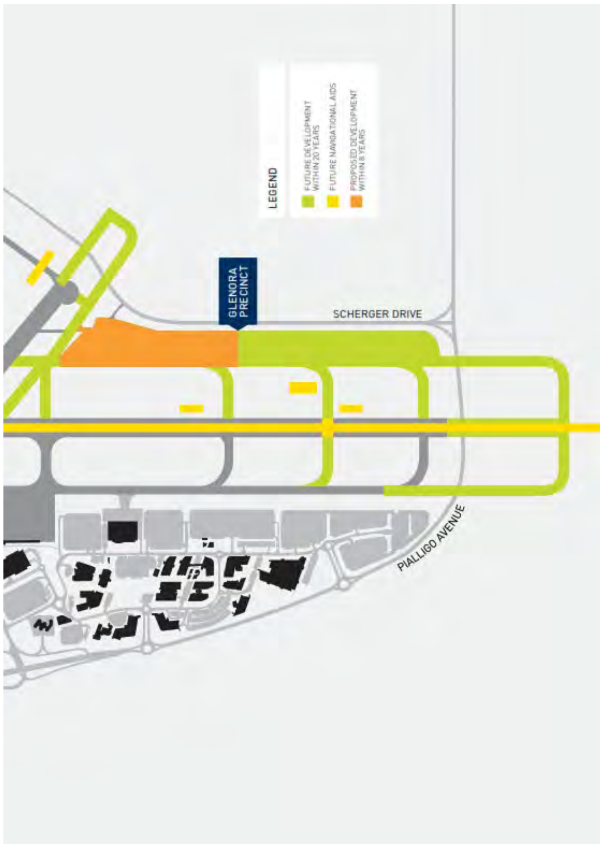
Figure 8.6 - Glenora precinct