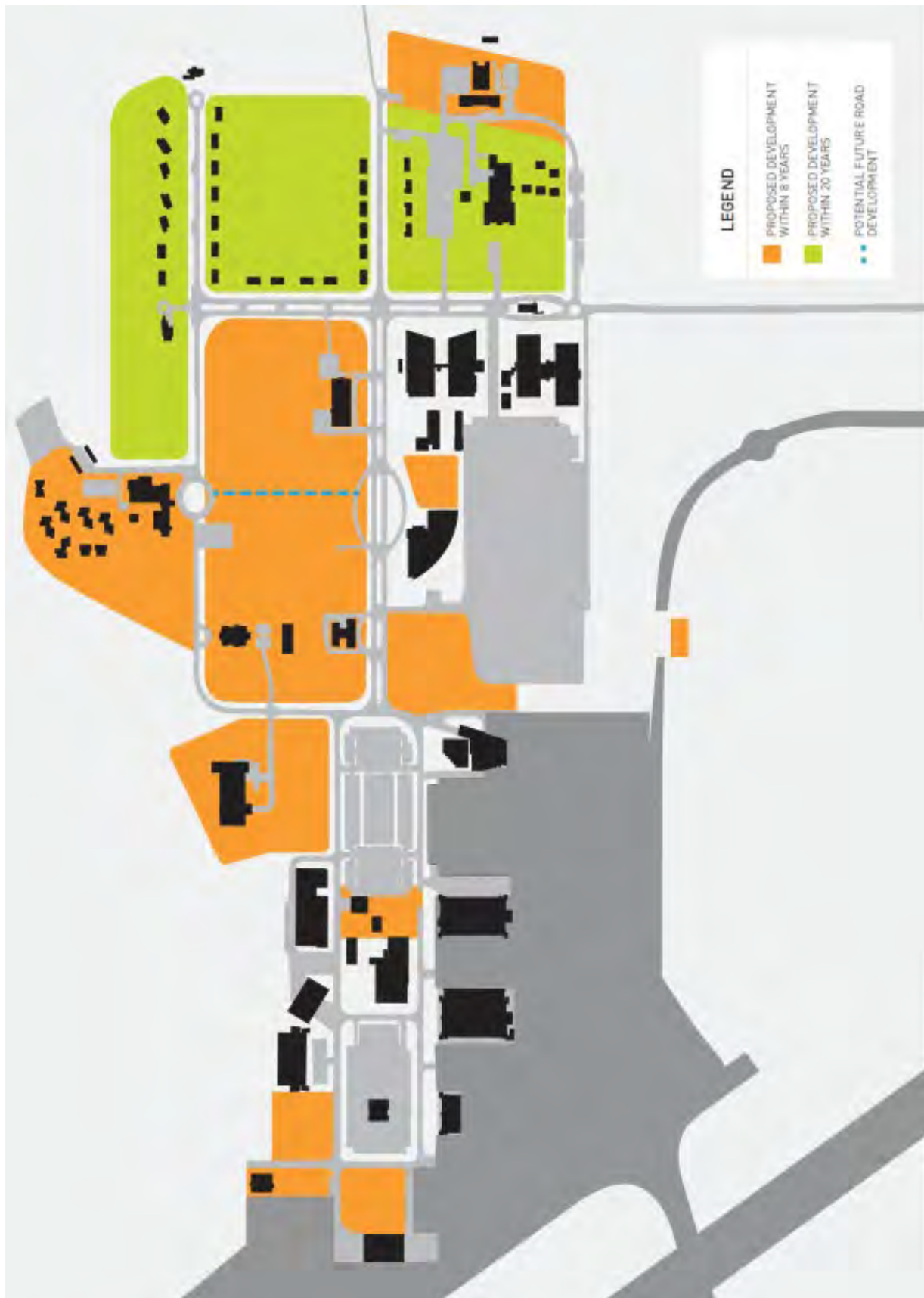
Figure 8.5 - Fairbairn precinct