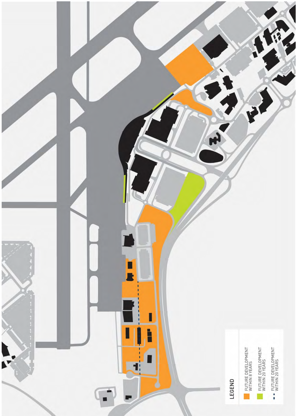
Figure 8.2 - Terminal and Pialligo precinct