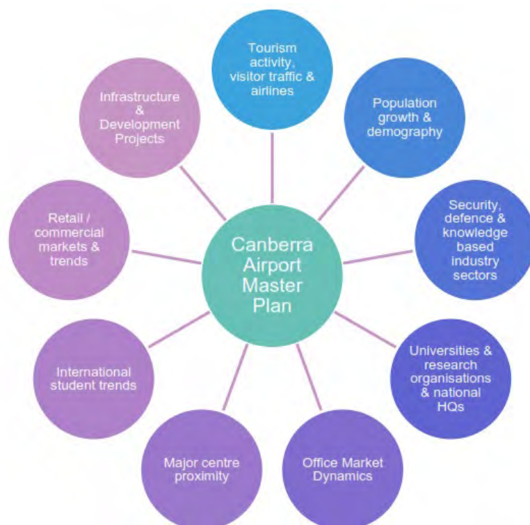
Figure 2.2 –Canberra Airport - Localised Trends and Influences

Urbis has provided the following 'Localised Trends and Influences' diagram: