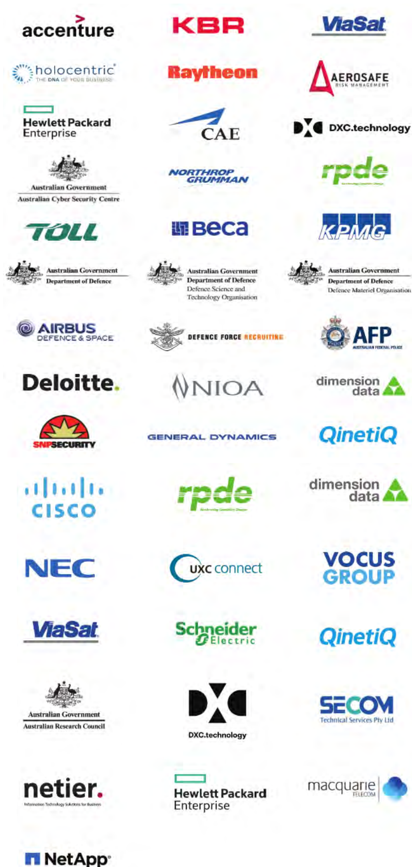
Figure 2.3 - Canberra Airport is home to Department of Defence, Department of Home Affairs, cyber security, aerospace and technology industries