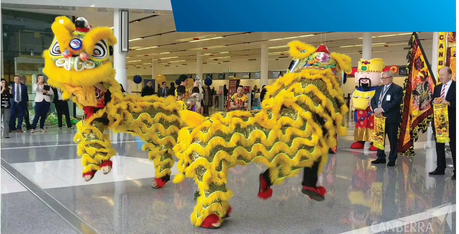
LION DANCERS FROM THE CANBERRA PROSPEROUS MOUNTAIN LION DANCE GROUP CAME TO CANBERRA AIRPORT ON 22 SEPTEMBER, TO MARK THE FIRST ANNIVERSARY OF SINGAPORE AIRLINES TOUCHING DOWN IN THE NATION'S CAPITAL.