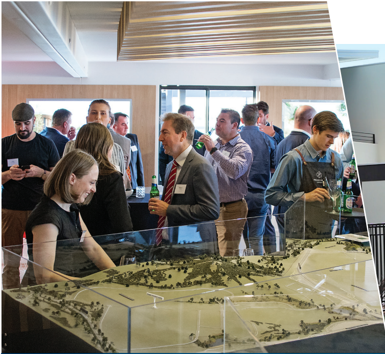
ATTENDEES ENJOYING THE OFFICIAL OPENING OF DENMAN PROSPECT'S NEW SALES SUITE ON 20 SEPTEMBER.