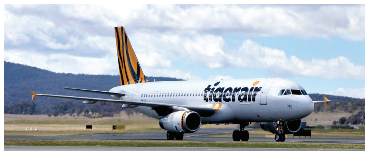
INAUGURAL FLIGHT TT813 ARRIVING AT CANBERRA AIRPORT FROM BRISBANE ON SEPTEMBER 15

From Friday September 15, Tigerair added an additional return