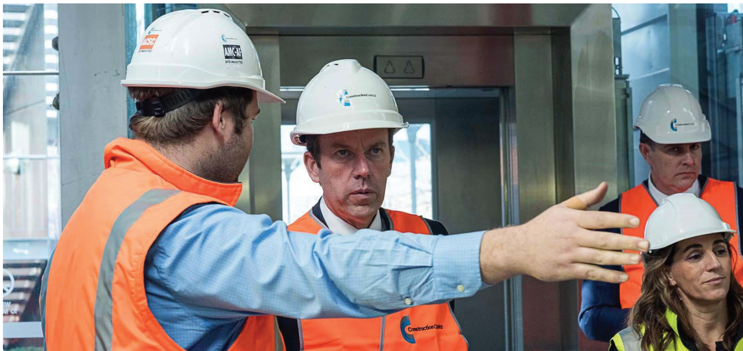
MINISTER ASSISTING THE PRIME MINISTER FOR CYBER SECURITY, DAN TEHAN (CENTRE), ON A SITE TOUR OF 14 & 16 BRINDABELLA CIRCUIT.