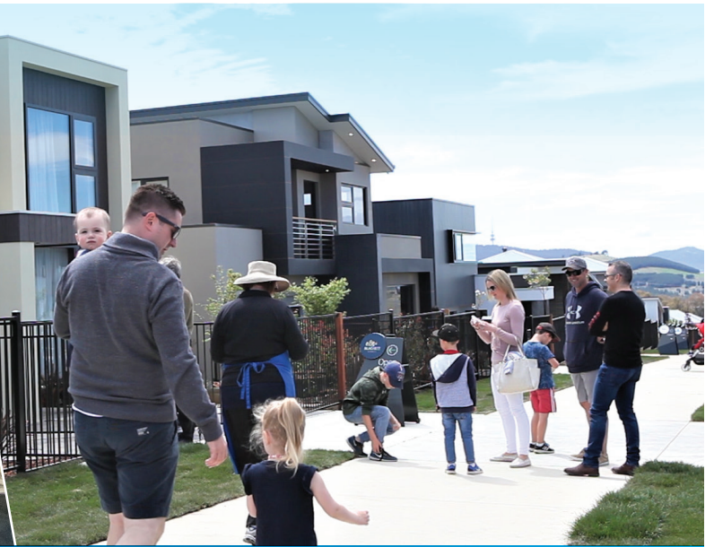
THE OPENING OF THE DENMAN PROSPECT DISPLAY VILLAGE ON 7 OCTOBER.