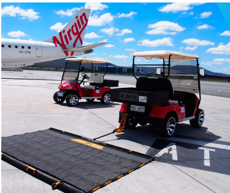
ABOVE LATEST ADDITION TO THE CANBERRA AIRPORT FLEET - 'STARSKY' AND 'HUTCH'.