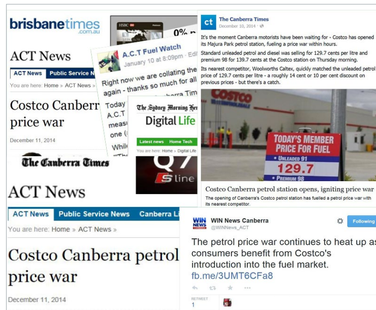
ABOVE COSTCO FUEL OPENING CAUSES A STIR.