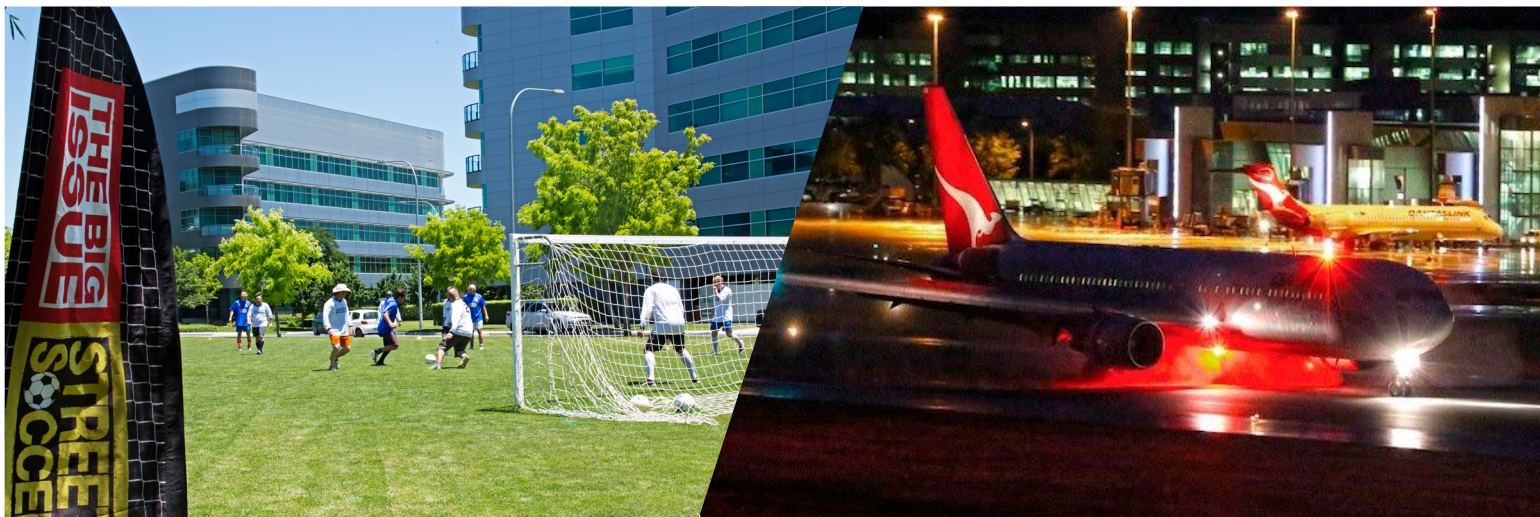
ABOVE THE BIG ISSUE SOCCER TEAMS HAVE A RUN AT BRINDABELLA BUSINESS PARK.