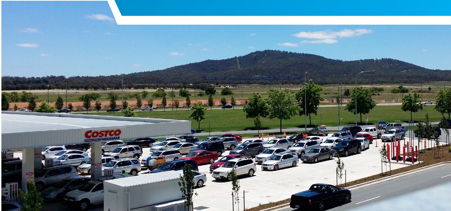
ABOVE REACTION FROM COSTCO MEMBERS WHEN COSTCO FUEL OPENED IN DECEMBER.