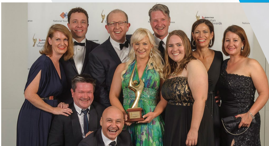
TOP CANBERRA AIRPORT TEAM AND SUPPORTERS AT QANTAS AUSTRALIAN TOURISM AWARDS IN ADELAIDE.