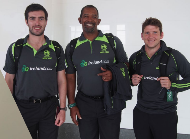
ABOVE ICC CRICKET WORLD CUP PLAYERS PASSING THROUGH CANBERRA AIRPORT