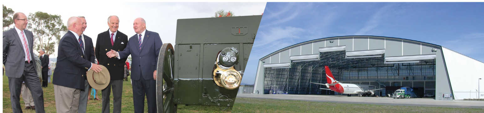
ABOVE THE GOVERNOR GENERAL AND OFFICIALS WELCOME THE WW1 GUN.