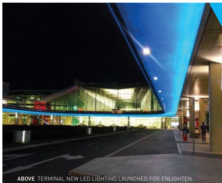
ABOVE TERMINAL NEW LED LIGHTING LAUNCHED FOR ENLIGHTEN.

The program will be up and running by October 2015.