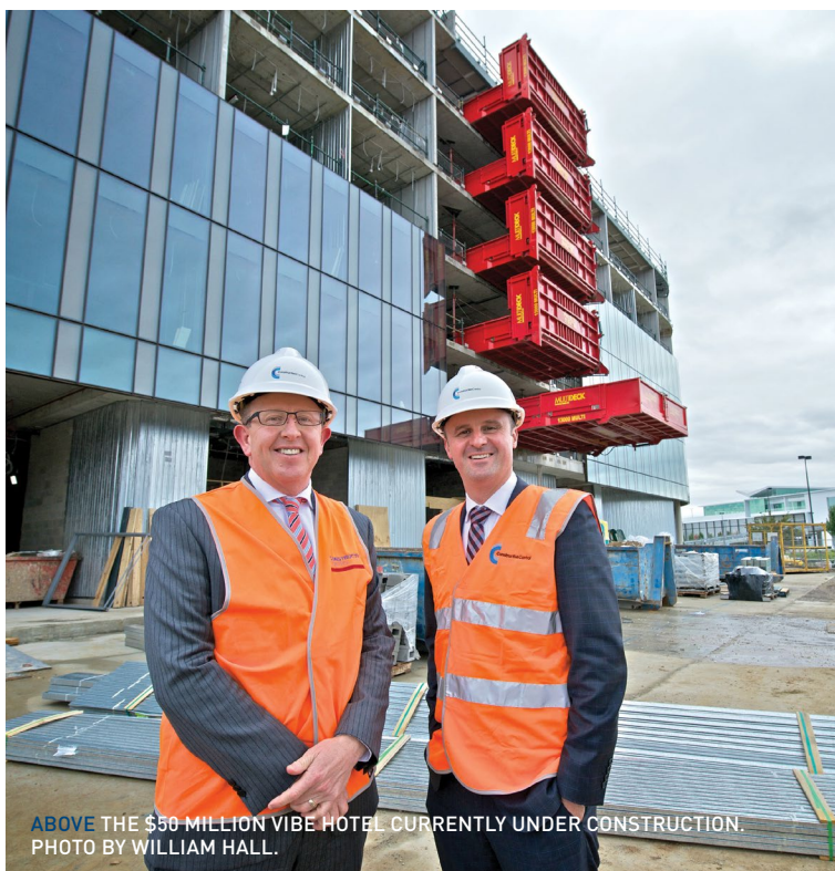
ABOVE THE $50 MILLION VIBE HOTEL CURRENTLY UNDER CONSTRUCTION.

I would like to take this opportunity to acknowledge the Capital Airport Group's significant investment in the future of Canberra".