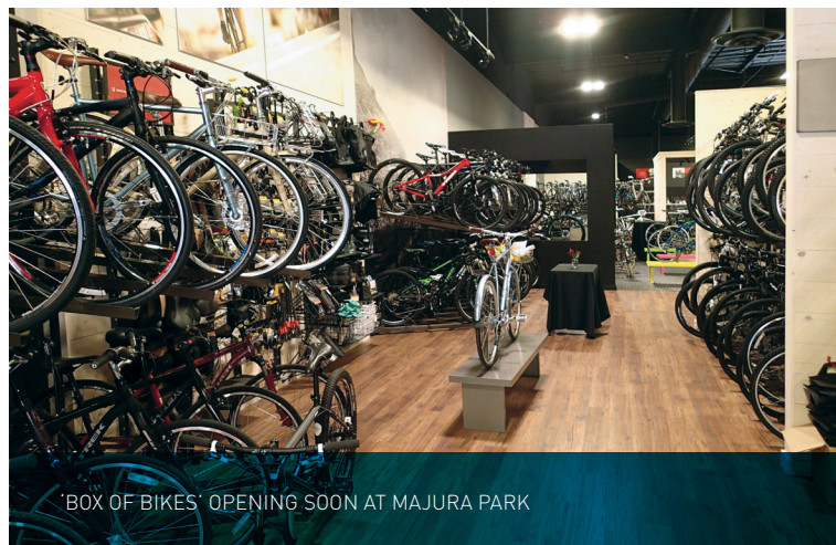
'BOX OF BIKES' OPENING SOON AT MAJURA PARK

Bookings can be made on the airline's website www.flypelican.com.au