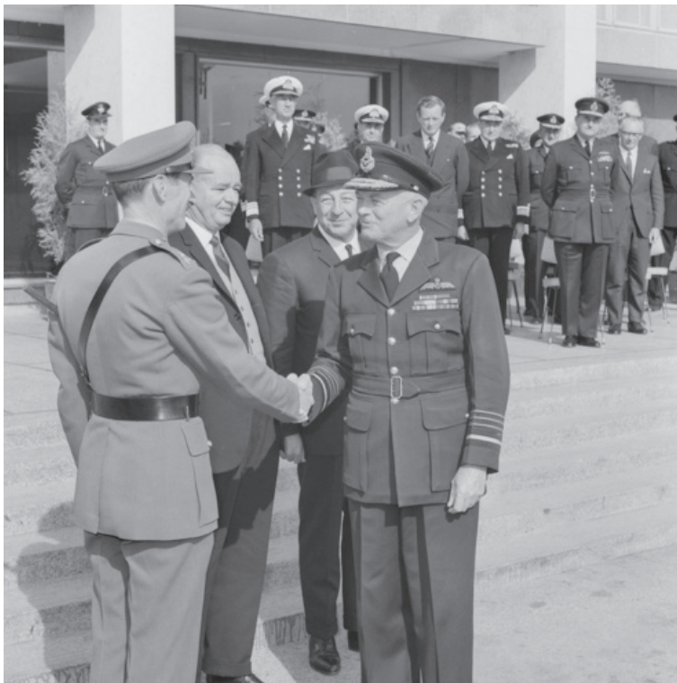
ABOVE AIR CHIEF MARSHAL SIR FREDERICK SCHERGER SHAKES HANDS WITH HIS SUCCESSOR LIEUTENANT GENERAL SIR JOHN WILTON ON HIS RETIREMENT.