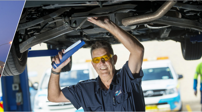
ABOVE CAR SERVICING AND REPAIRS NOW AT MAJURA PARK.

Costco Gasoline will be located on Mustang Avenue, Majura Park, adjacent to the Costco Warehouse. Construction is underway with completion expected by Christmas.