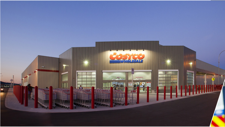
ABOVE COSTCO FUEL COMING TO MAJURA PARK.