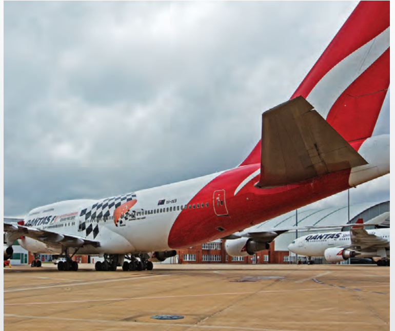
ABOVE A 747-400 FROM HONG KONG AT CANBERRA AIRPORT

"There is no better demonstration of Canberra Airport's capability than the accommodation and management of today's additional air traffic."