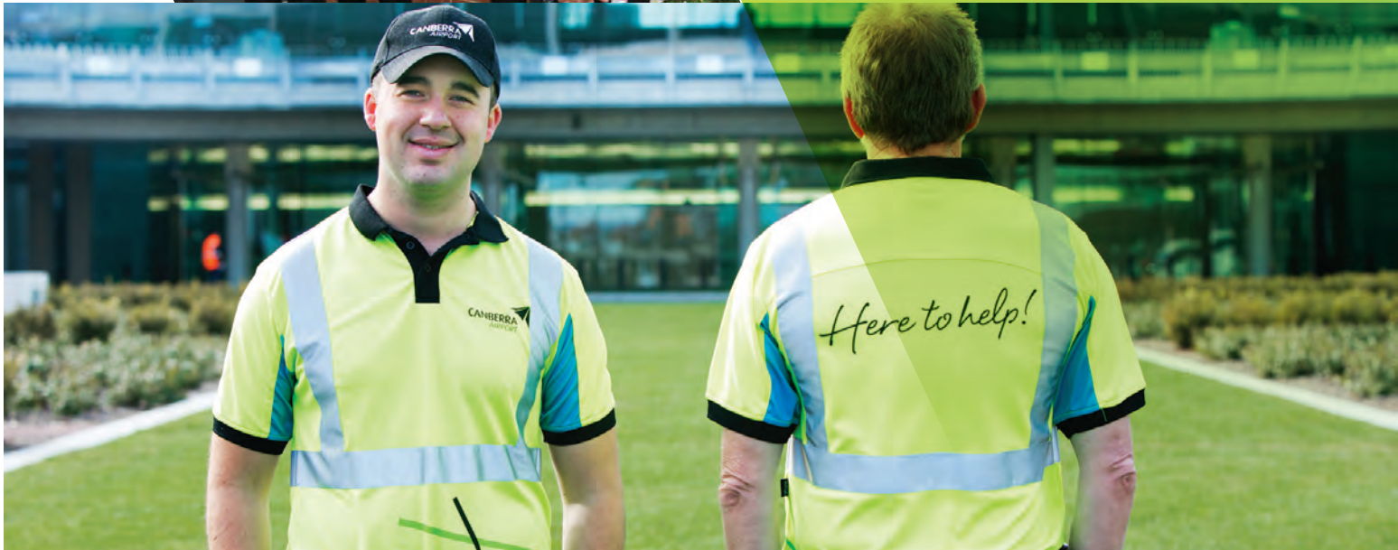
ABOVE CAPITAL AIRPORT GROUP STAFF DONNING THE NEW UNIFORMS.

““WE ARE HERE TO HELP. THAT IS OUR JOB – ALL OF OUR JOBS. THE NEW UNIFORMS SEND A REALLY STRONG SIGNAL TO ALL OUR CUSTOMERS”