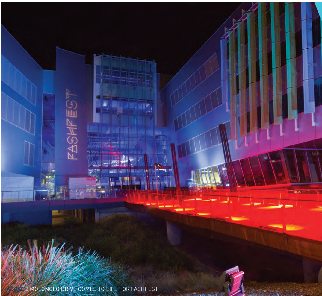
ABOVE 3 MOLONGLO DRIVE COMES TO LIFE FOR FASHFEST