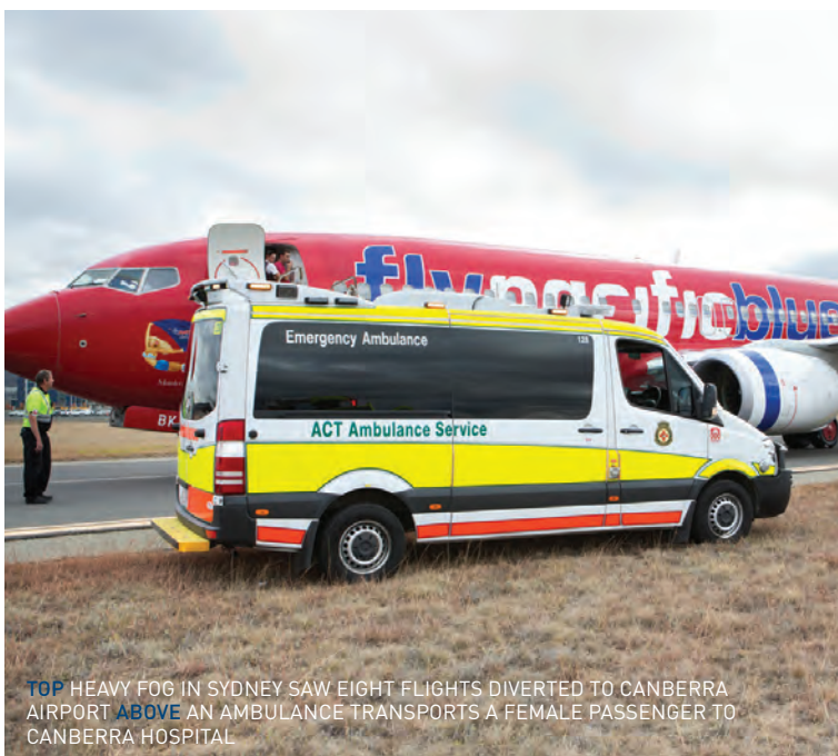
TOP HEAVY FOG IN SYDNEY SAW EIGHT FLIGHTS DIVERTED TO CANBERRA AIRPORT ABOVE AN AMBULANCE TRANSPORTS A FEMALE PASSENGER TO CANBERRA HOSPITAL