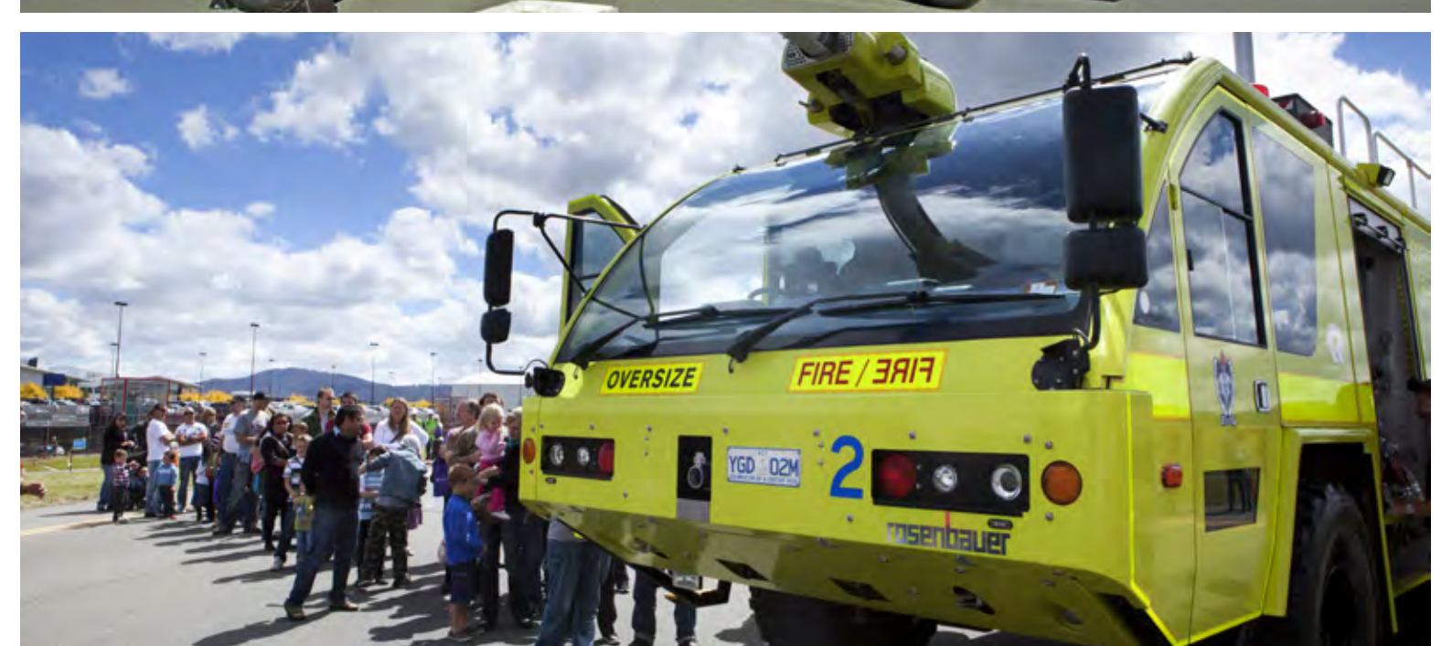
TOP THE WEEKEND TODAY SHOW'S EMMA FREEDMAN DOING A LIVE WEATHER CROSS FROM THE OPEN DAY. MIDDLE THE HISTORICAL AVIATION RESTORATION SOCIETY'S CATALINA FLYING BOAT. ABOVE CROWDS LINE UP TO HAVE A LOOK AT THE AVIATION RESCUE AND FIRE FIGHTING SERVICES TRUCK.