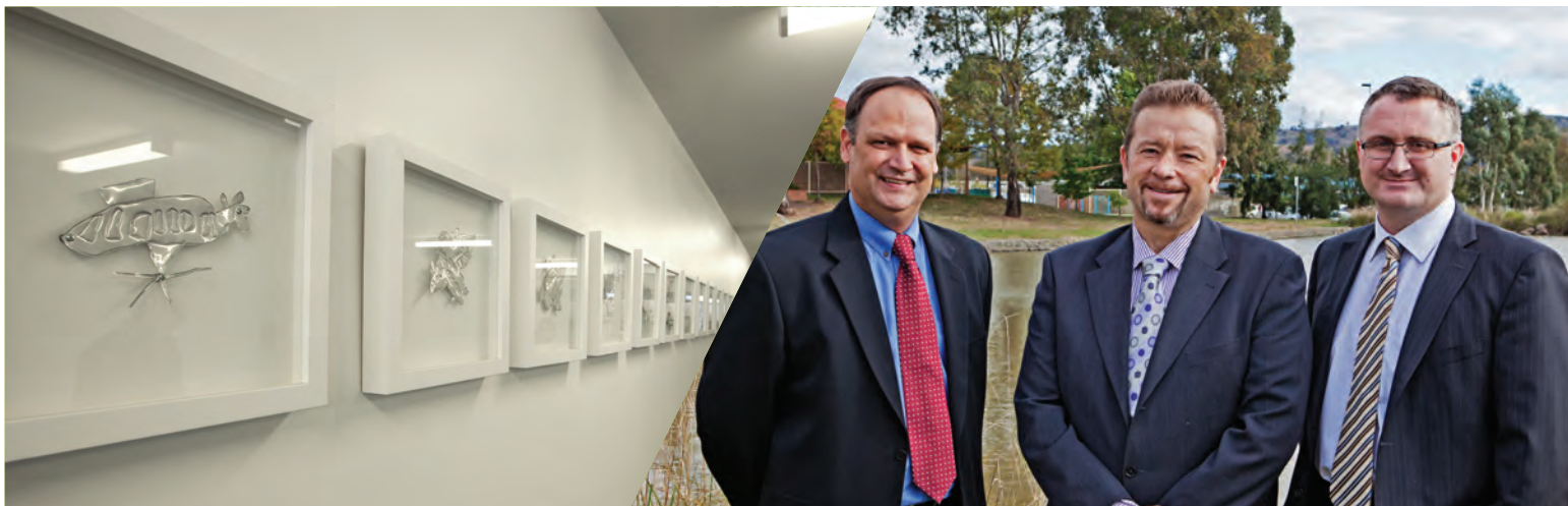
ABOVE THE CHILDREN'S PLANE METALWORKS, LOCATED IN THE ENTRY ON THE DEPARTURES LEVEL AT CANBERRA AIRPORT.