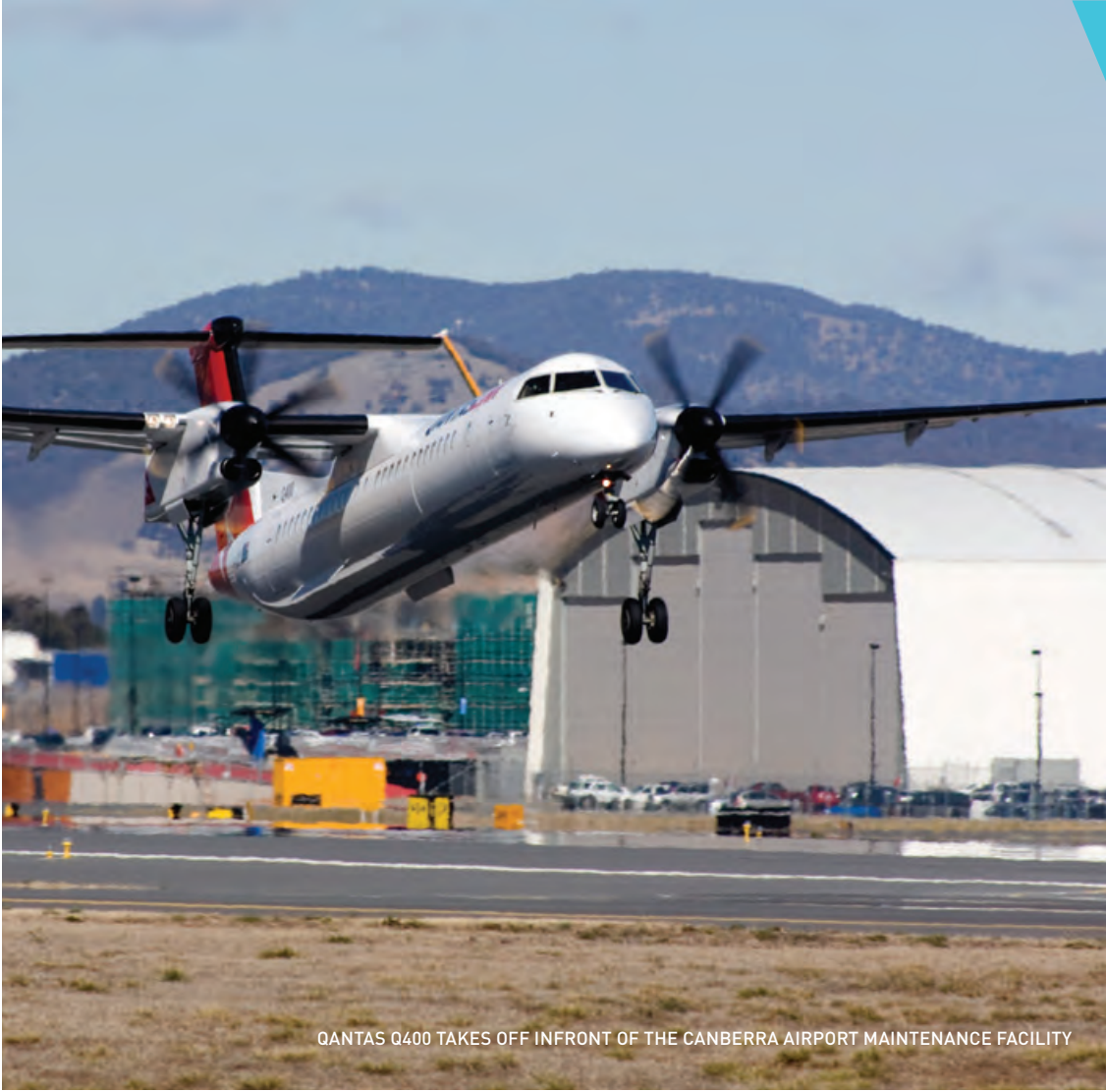
QANTAS Q400 TAKES OFF INFRONT OF THE CANBERRA AIRPORT MAINTENANCE FACILITY