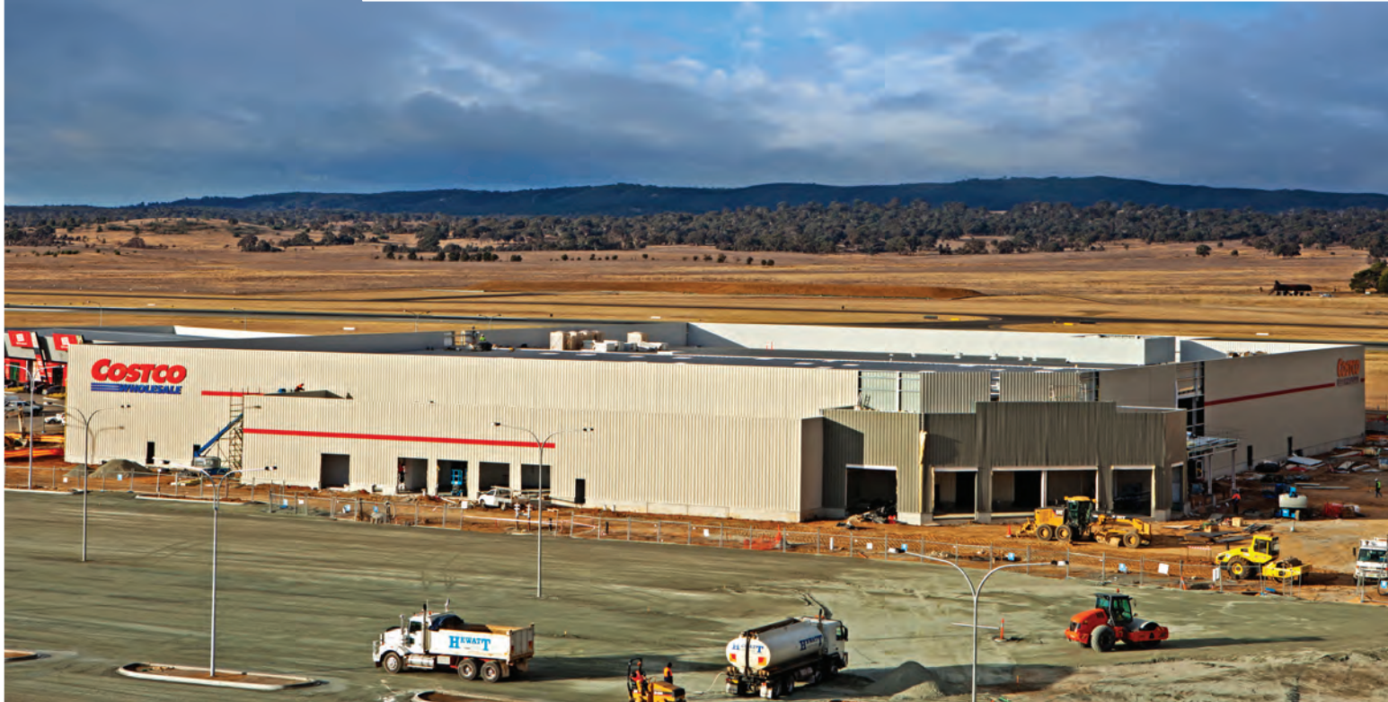
ABOVE COSTCO WAREHOUSE UNDER CONSTRUCTION AT CANBERRA AIRPORT.