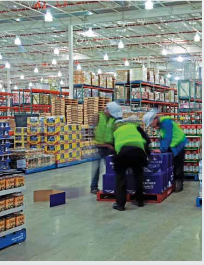
ABOVE WORKERS STOCK THE SHELVES IN PREPARATION FOR 22 JULY OPENING.

In order to experience this new and exciting retail venture, a Costco membership is required for both households and businesses. To sign up, go to www.costco.com.au or visit the Costco membership office located in Majura Park.