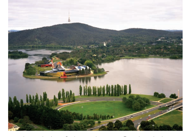
wanted to put that into a Canberra region context. From the projections that we have been provided with, it's clear that we will be a major economic contributor to the ACT and surrounding region well into the future".