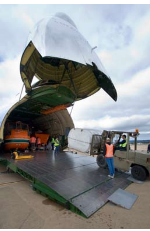
Above left: Google Earth image shows the impact of aircraft noise on the Canberra Region. Above Right: Freight operations at Canberra Airport.

There has been unprecedented interest in the Master Plan with over 230 submissions from community, business, government and industry sectors, demonstrating a high level of interest in the development of the airport and its role as a national gateway.