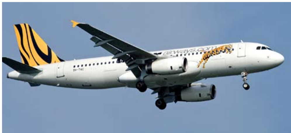
Canberra tames a Tiger.