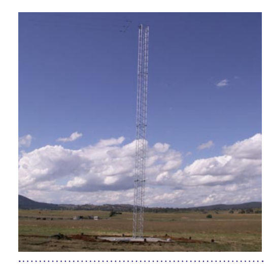
The new Non Directional Beacon

The Doppler VOR is engaged by pilots to determine the direction of the aircraft from any position to or from the VOR. Airservices Australia says the Canberra Doppler VOR required new equipment including electronic racks, 49 antennas, and associated feeder cable and monitor antenna. "Airservices radio, electrical, mechanical and lines staff from Canberra International Airport completed installation of the new aids to a high standard and within tight timeframes," the spokesman said. "Airservices is pleased to continue working with the Airport to ensure all facilities provided maximum efficiency to airlines and the traveling public."