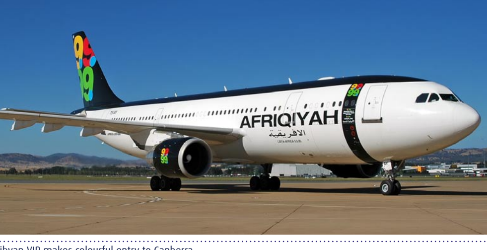
Libyan VIP makes colourful entry to Canberra

The runway lengthening is necessary for aircraft to fly to more distant destinations without having to "block out" seats. Aircraft do not perform so well on days with high temperatures. Currently longer range flights may not be able to operate out of Canberra at full passenger loads on days above 35°C because of insufficient runway length, making some routes commercially unfeasible. "This lengthening will ensure there is