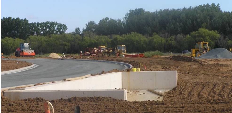
New roundabout on Pialligo Avenue eases traffic flows

Designed to take further pressure off the main Airport entry roundabouts on Pialligo Avenue, the new access road will improve access for people working in the non-competitive environment. Airport's general aviation sector. "RPDE is proving to be an effective example of partnering between industry and the Australian Department of Defence," Senator Hill said.