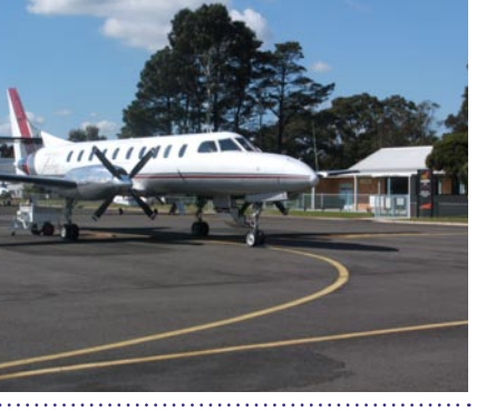
Brindabella's inagural touches down at

Passengers can book flights at www.brindabellaairlines.com.au or on 02 6248 8711