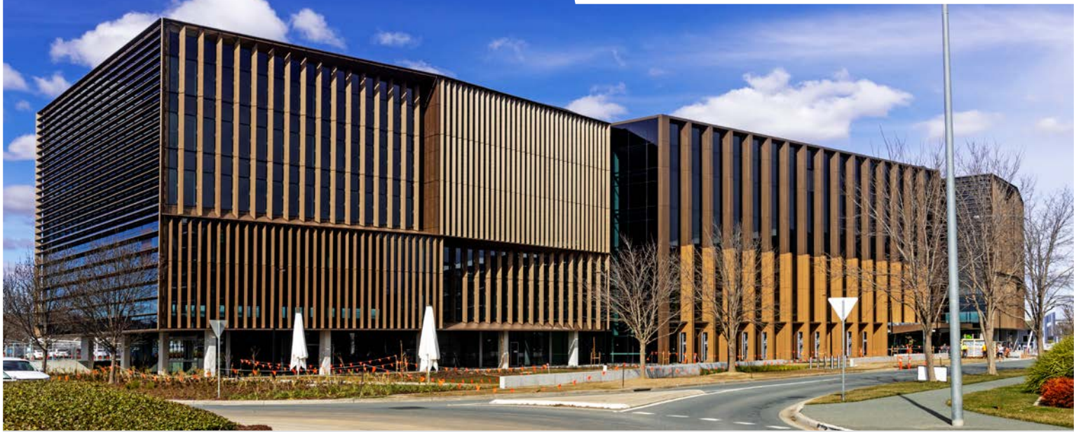
25 CATALINA DRIVE, MAJURA IS THE FIRST BUILDING IN THE ACT TO ACHIEVE A SIX STAR RATING UNDER THE GREEN STAR DESIGN & AS BUILT CERTIFICATION.