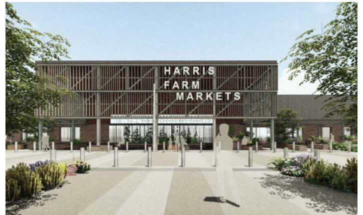
ARTIST IMPRESSION OF HARRIS FARM MARKETS

Construction is on track to complete and handover the new, purpose-built retail building at Majura Park to Harris Farm Markets in the coming weeks. This milestone will allow Harris Farm Markets to commence the construction of their internal fitout with a view to open for trade in early 2024. Once open, this new innovative, fresh food shopping experience will be the first of its kind in Canberra, joining retail giants already located at Majura Park, including Costco, Woolworths and Aldi, making Majura Park the gourmet grocery destination of Canberra.