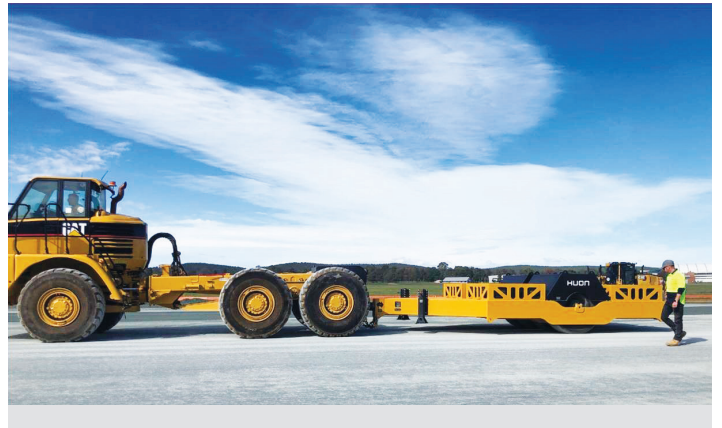
THE NEW TARMAC NAMED TAXIWAY BRAVO AT CANBERRA AIRPORT.

The Airport Terminal new retail and food and beverage upgrades continue, including the construction of The Capital Brewing Co Tap Room, and Go Convenience. Across the airport precincts a new carpark has been completed at Brindabella Business Park, as well as a wellness hub including a gym, and café. Over at Majura Park, Oporto has undertaken a refurbishment, Costco Fuel has expanded, and Zambero will open in late June 2020.