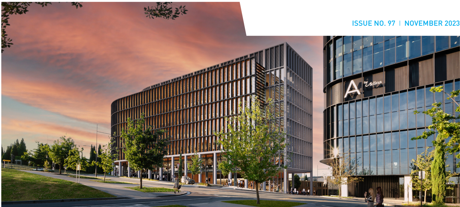
ARTIST RENDER OF THE NEW OFFICE DEVELOPMENT AT CONSTITUTION PLACE