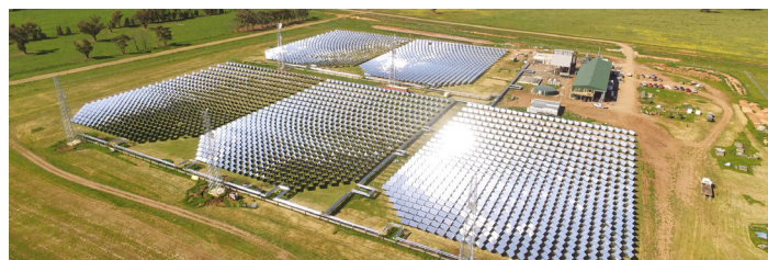
WORLD-FIRST GREEN METHANOL DEMONSTRATION PLANT IN PORT AUGUSTA

The low-cost carbon free power and heat delivered by this technology can be dispatched to the grid, or used as a thermal battery, stored for later dispatch. This increased duration of storage (up to 16 hours), in comparison to current battery storage, will support large-scale transition to renewables such as solar and wind.