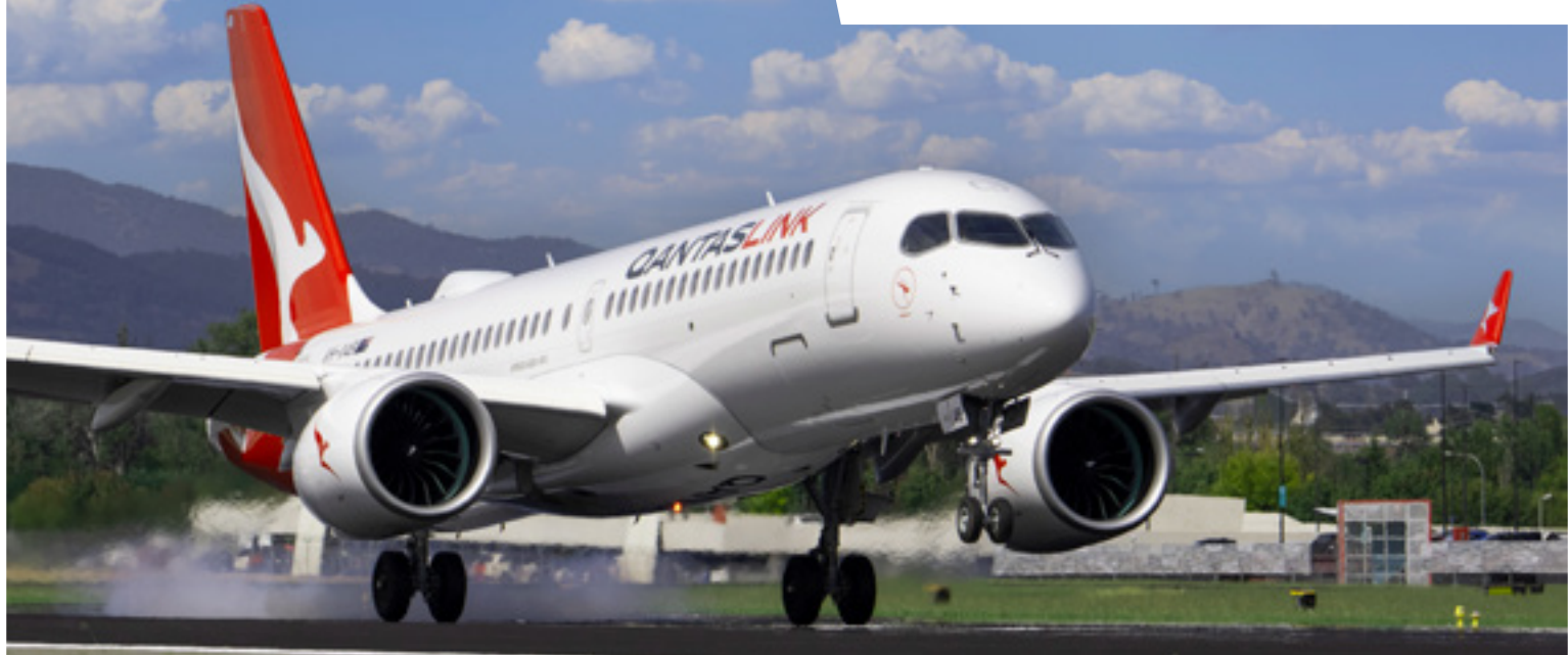
QANTASLINK'S MAIDEN A220 FLIGHT TOUCHES DOWN IN CANBERRA