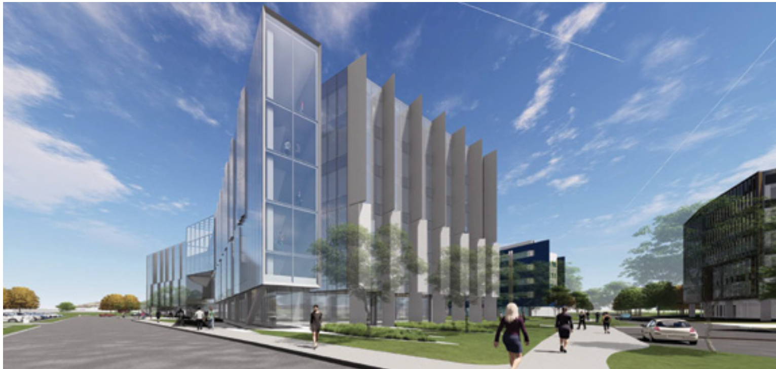
ARTIST IMPRESSION OF 3 WELLINGTON PLACE, MAJURA PARK