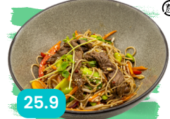
SINGAPORE NOODLES CHICKEN, PRAWN, SEASONAL VEGE, VERMICELLI NOODLES