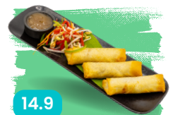
BBQ PORK BUN X3 W/ SOY & SWEET CHILLI SAUCE