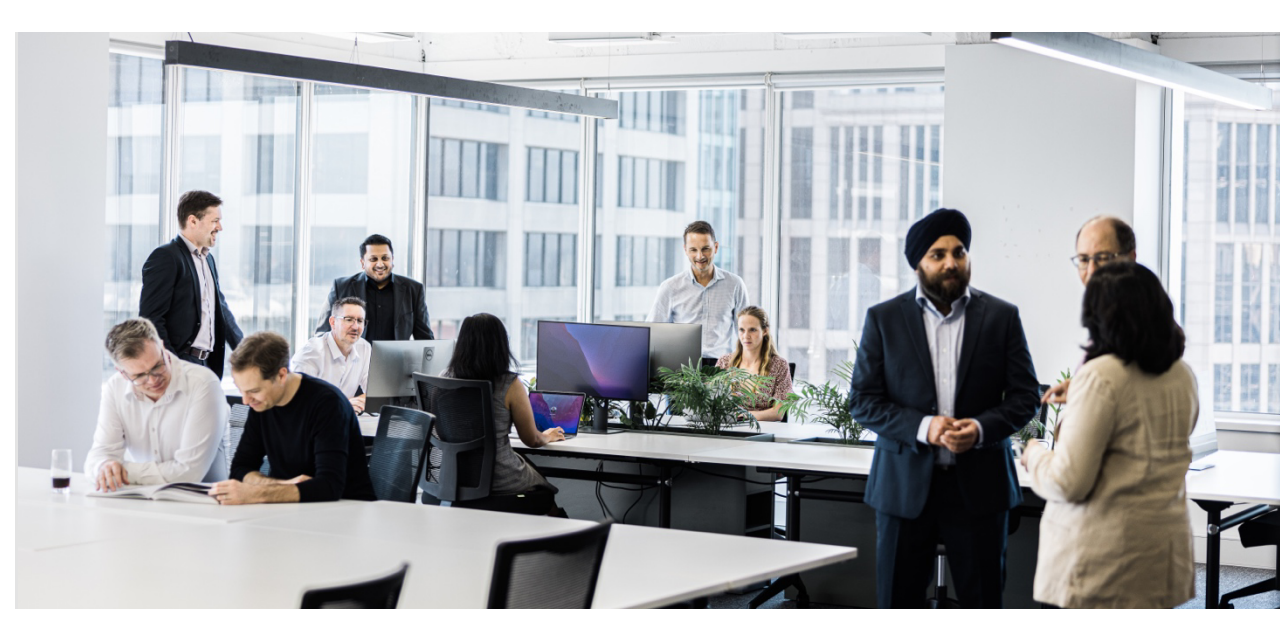
Main working area with northerly and easterly views into CBD and the Yarra river.