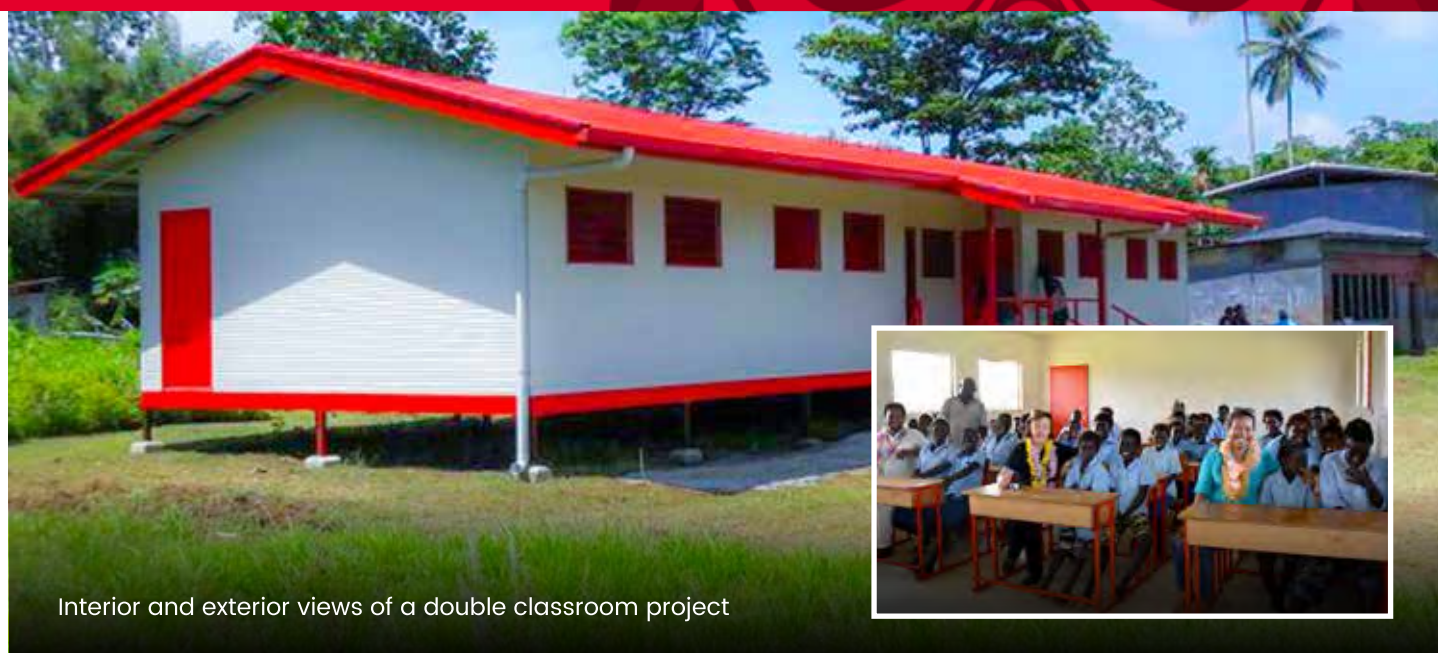
Interior and exterior views of a double classroom project