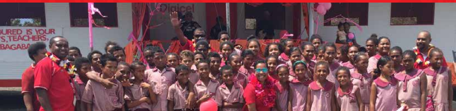
Happy students of Gabagaba Primary School in Central Province all smiles for their new Foundation funded classroom.