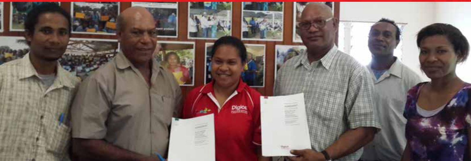
Foundation & Ginigoada sign the MOA for the FY15/16 Life & Business Skills Program in Lae, Morobe Province.