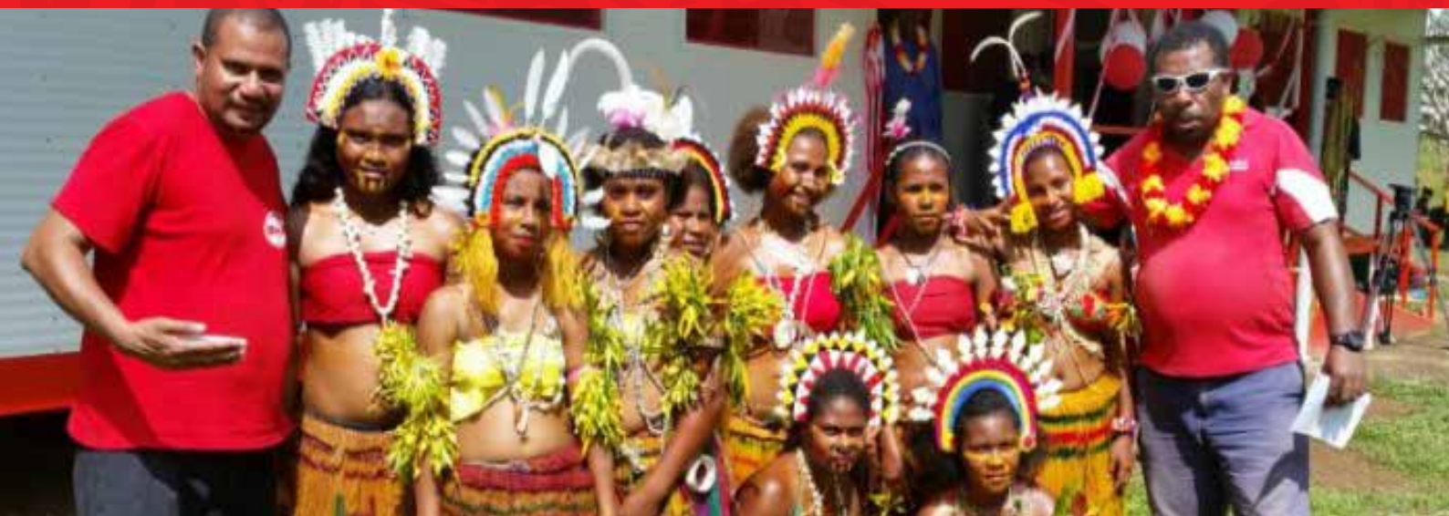
Beautiful Kairuku ladies in traditional attire during the St Maria Goretti Primary School launch.