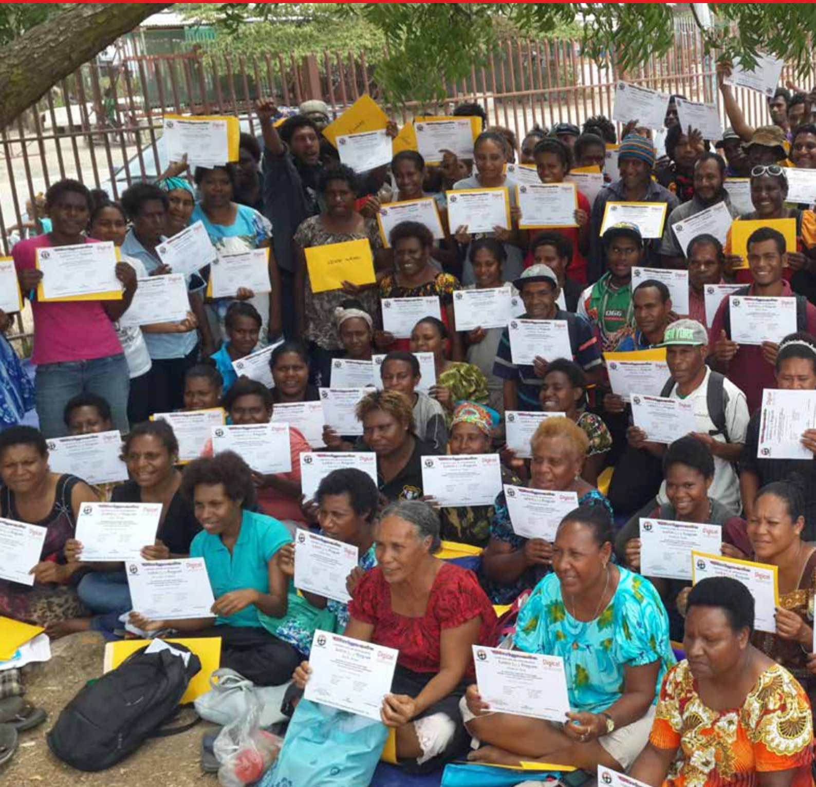
Graduands of the Life & Business Skills program held at Gerehu Stage 1 Kuanua Church in Port Moresby proudly display their certificates on graduation day.