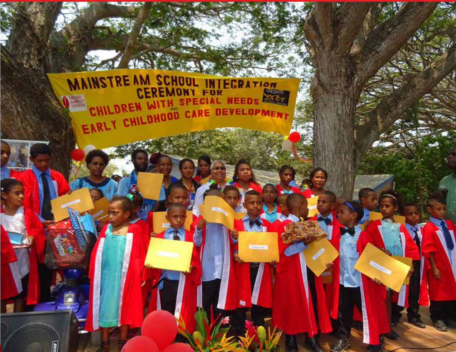
Students from the Cheshire disAbility Services Special Education Resource Centre during their graduation ceremony held on the International Day for People with Disabilities