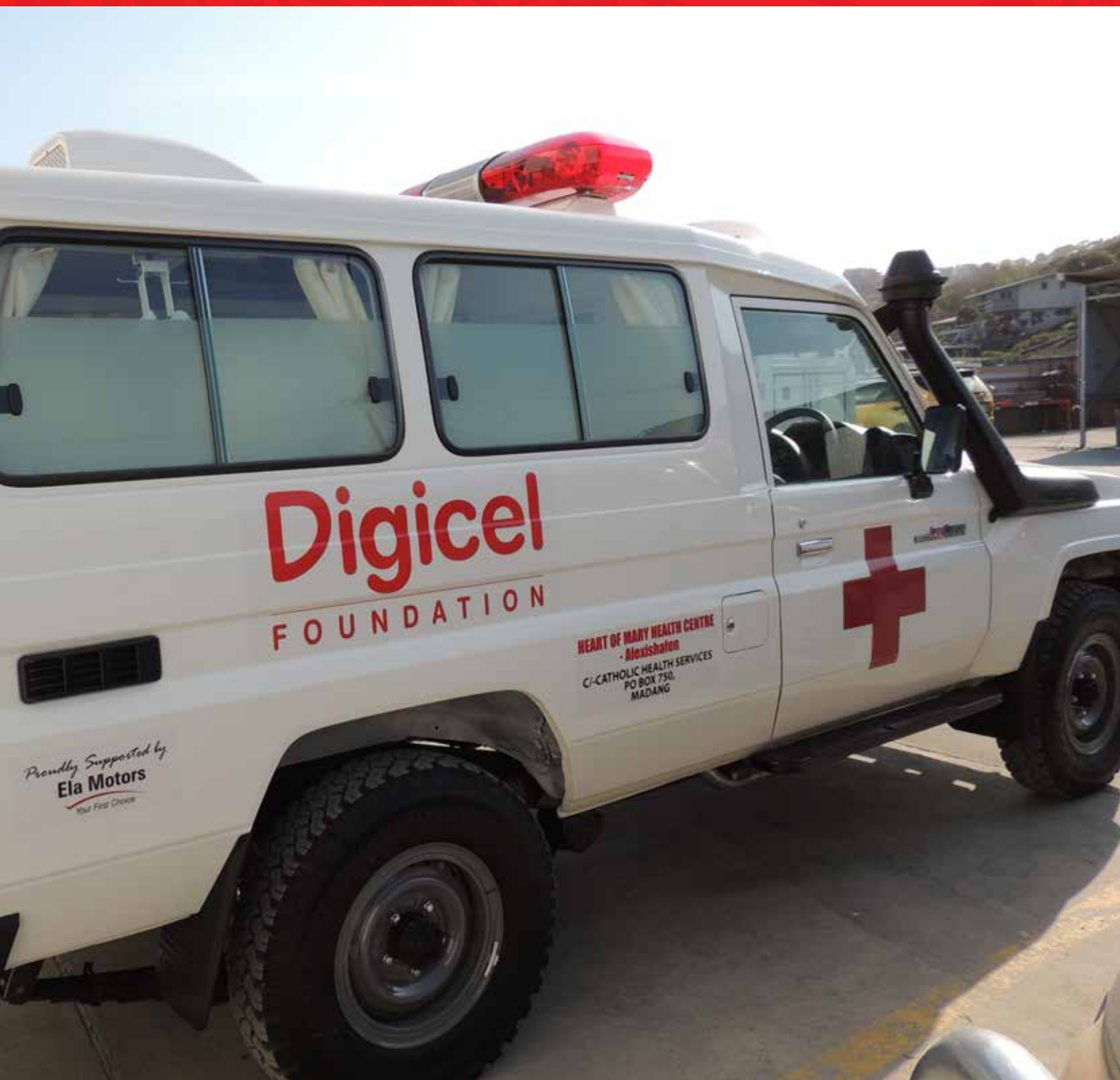
The Mobile Health Clinic for Heart of Mary Health Centre – Alexishafen in Madang Province ready for delivery