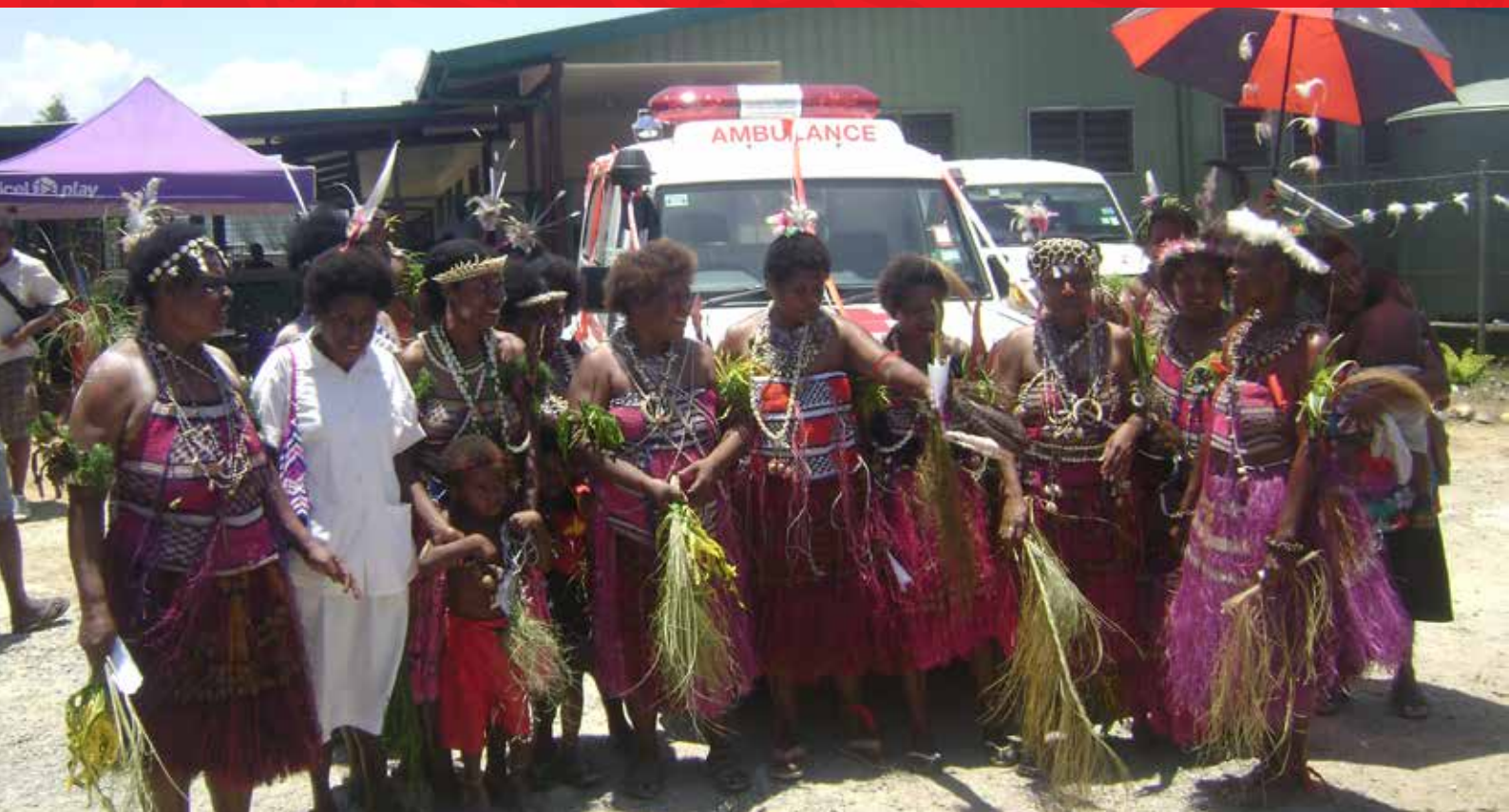
Nurses from Heart of Mary Health Centre in Madang traditional attire during the handover of the Mobile Health Clinic.