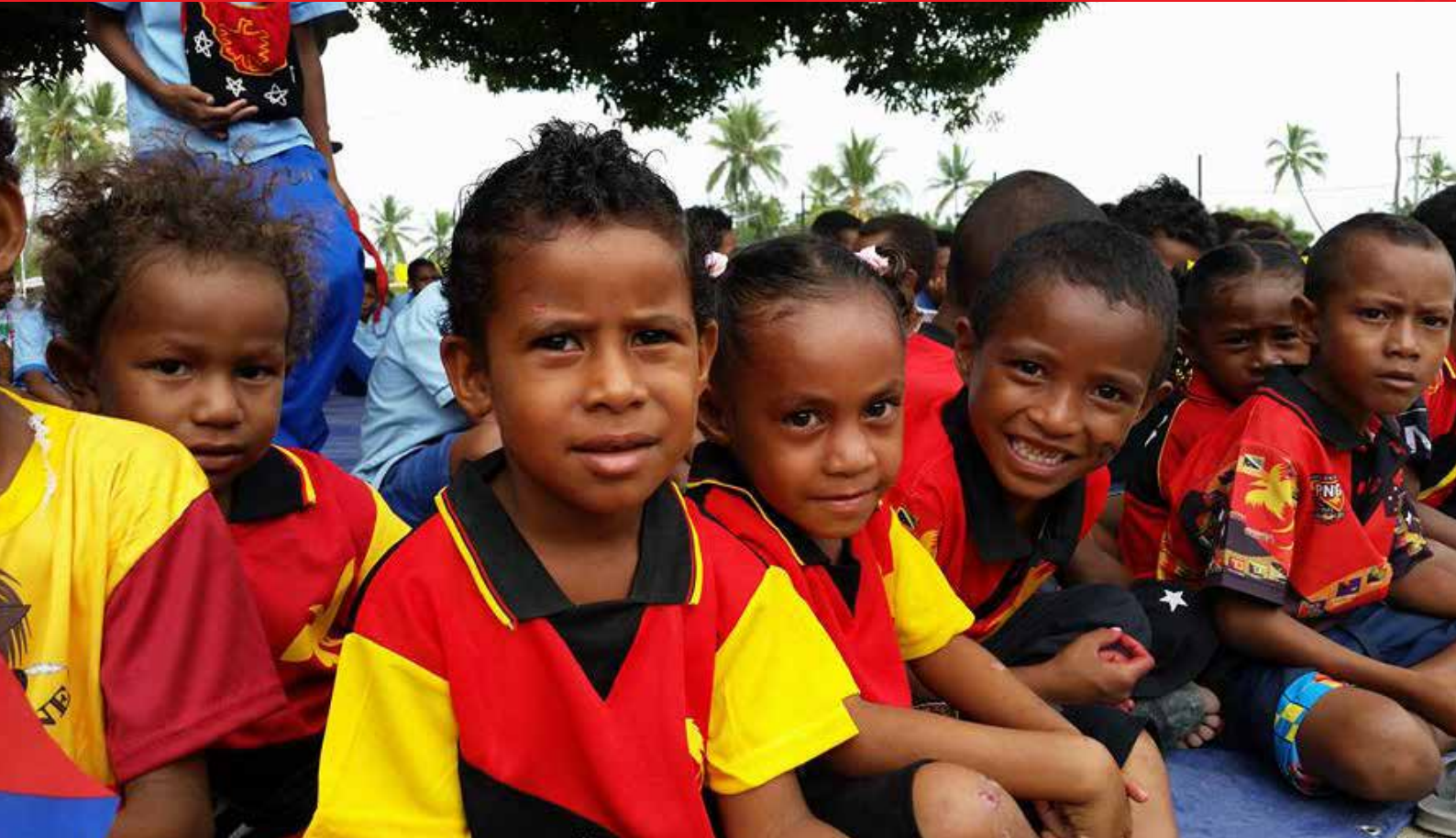
Happy students from Barakau Elementary School during Independence Day Celebrations.

Where Digicel as a Business grows, so too much its communities