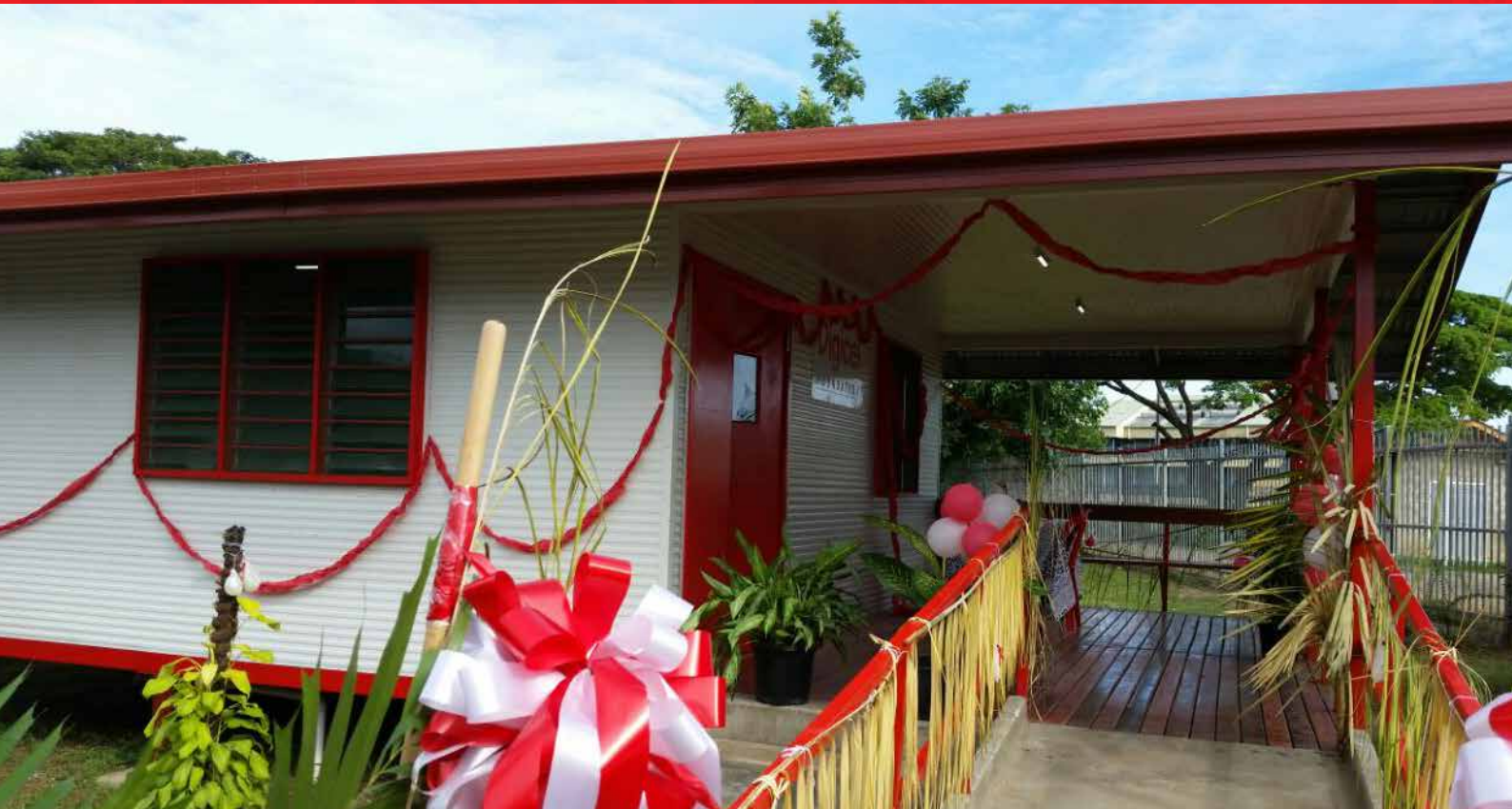
Laloki Rural Health Aid Post ready for ribbon cutting on official launch day.