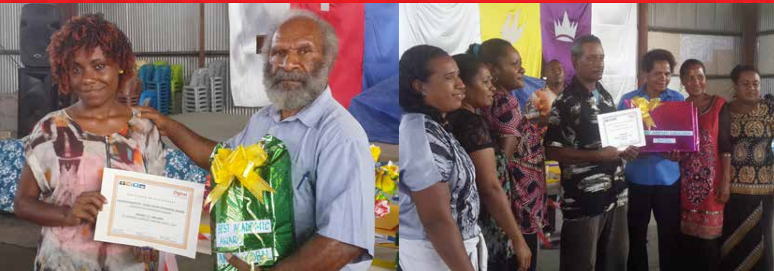
Graduates of the 2015 Isi Learning Teacher Training Program Graduation in Gerehu, National Capital District