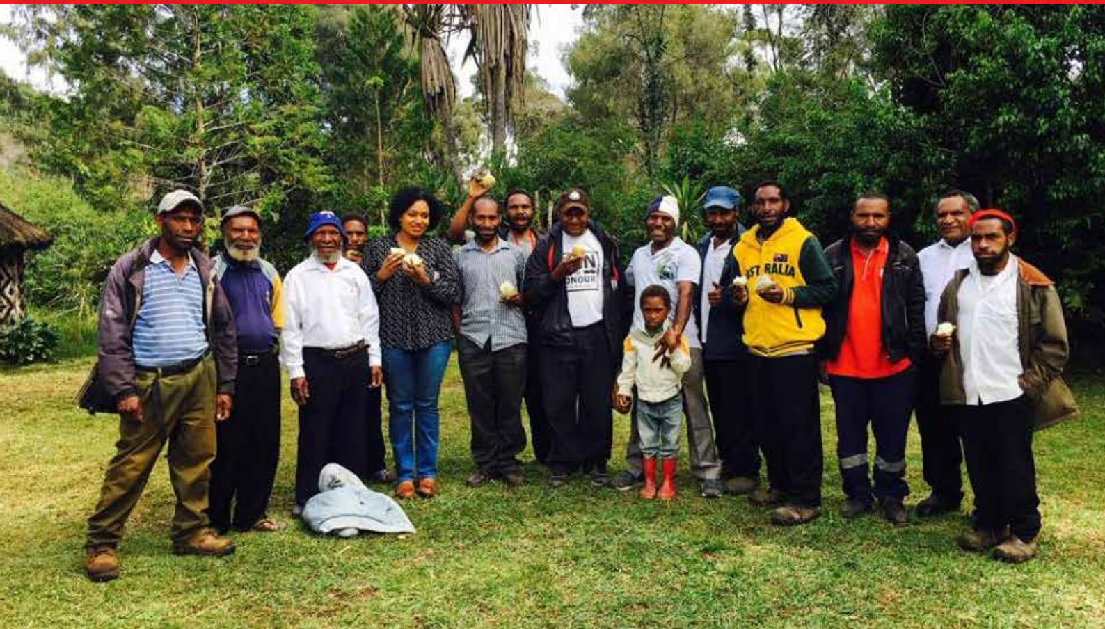
Residents of Tamal Village in Western Highlands Province with our Men of Honour Independent judges.

For us to make true and lasting change in the space of violence, we must empower both men and women for the anti-violence equation to be complete