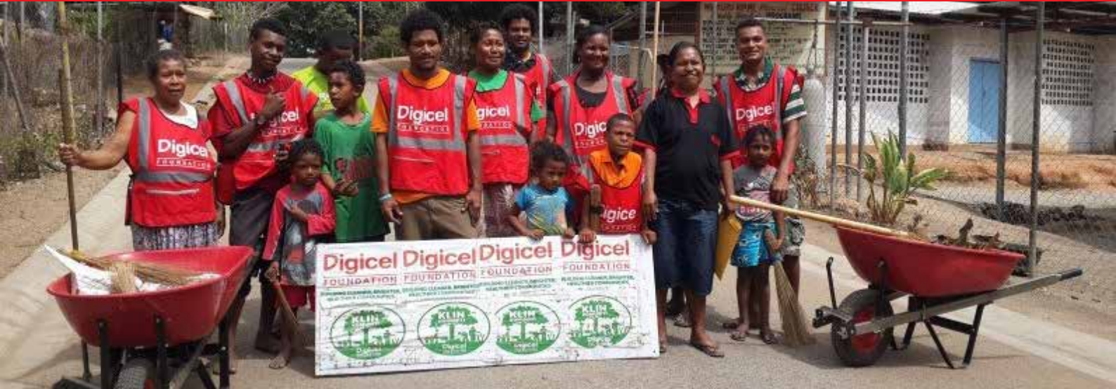
Volunteers of the Klin Komuniti Program in Mahuru Village.