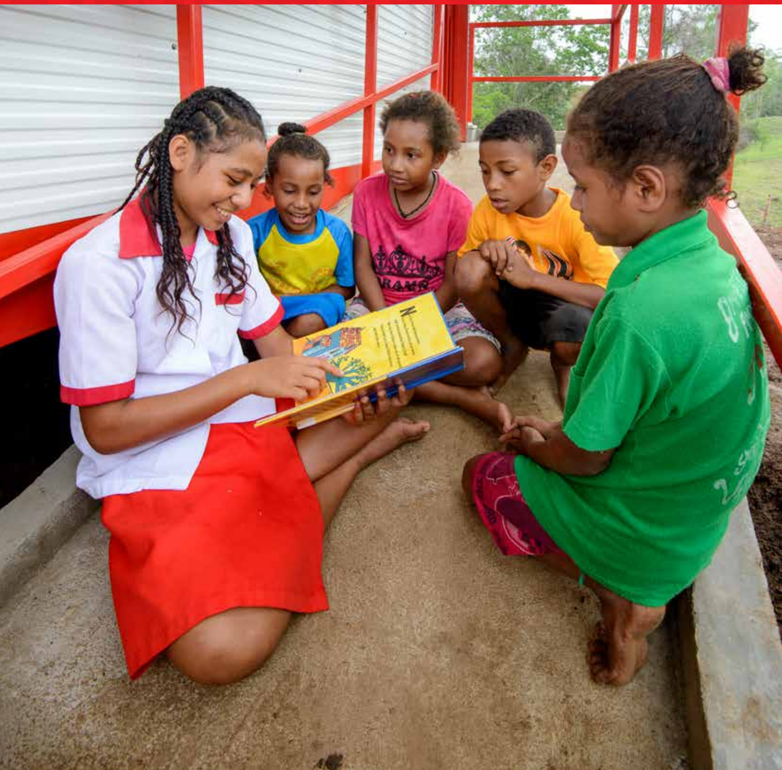
A student reads to young children at the Magauto Primary School library in Rigo, Central Province.