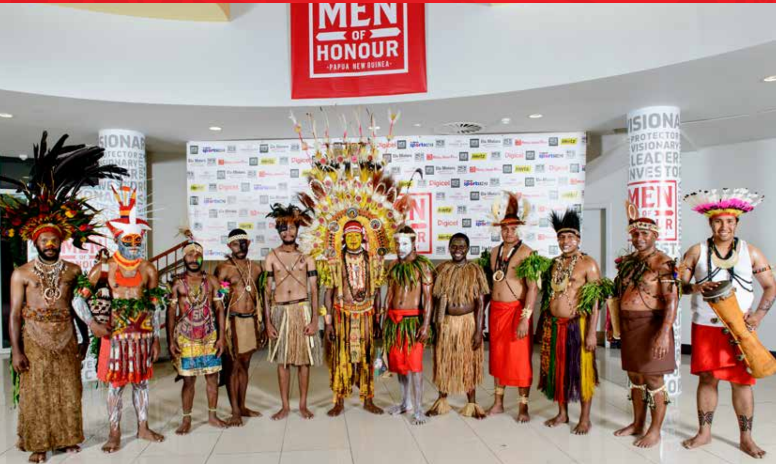
Digicel PNG Ltd volunteers who formed the Guard of Honour for the 2015/16 Men of Honour Awards Gala Night.

As a Foundation, Digicel PNG Foundation aims to break the cycle of violence through focusing on positive behaviour for affirmative action. Papua New Guinean men have been vilified for decades but there are honourable men who are alleviating suffering and preserving human dignity in the roles they play.