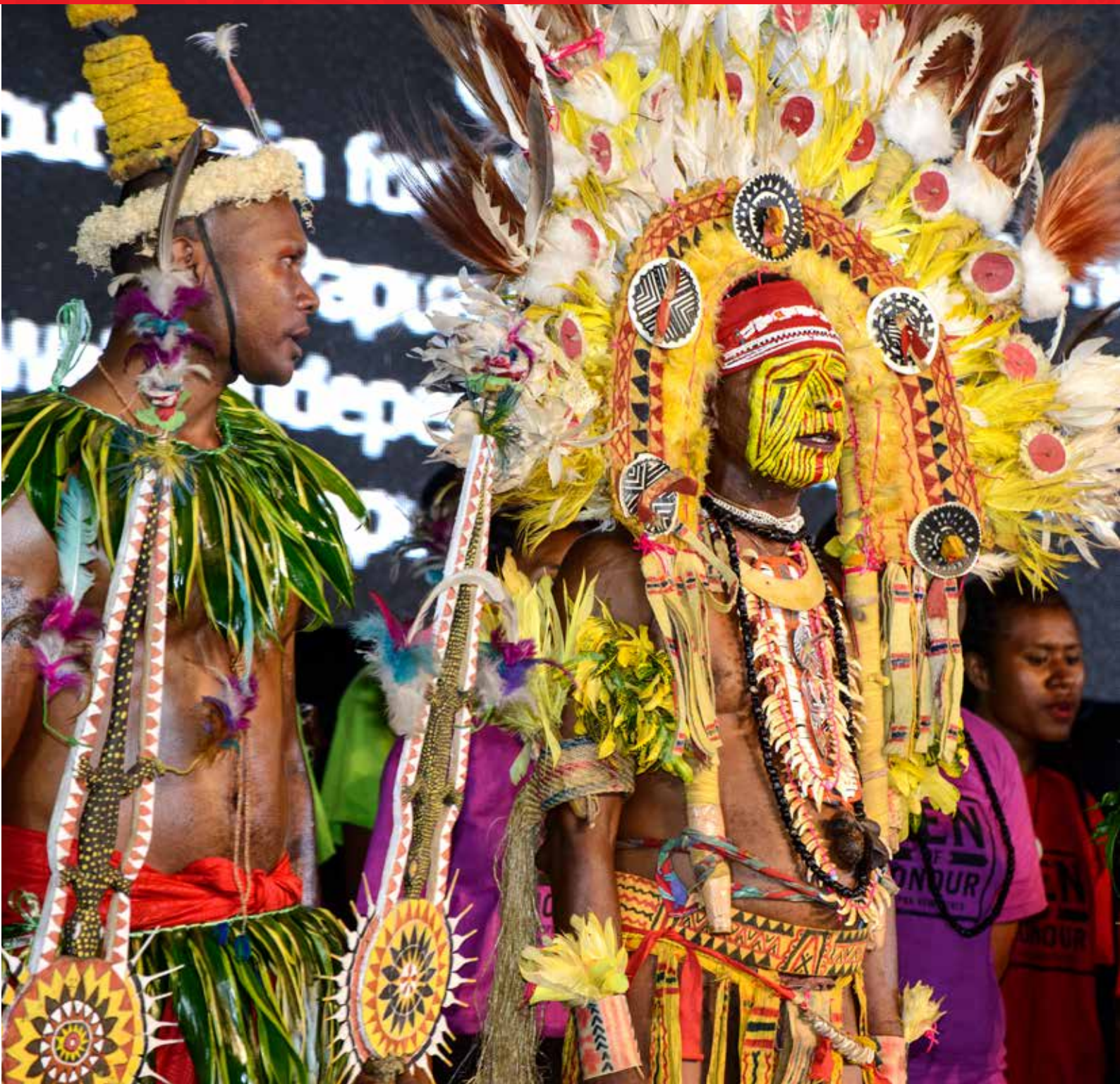
Digicel volunteers form the Guard of Honour and sing Papua New Guinea's National Anthem during the 2015/16 Men of Honour Award Gala Night