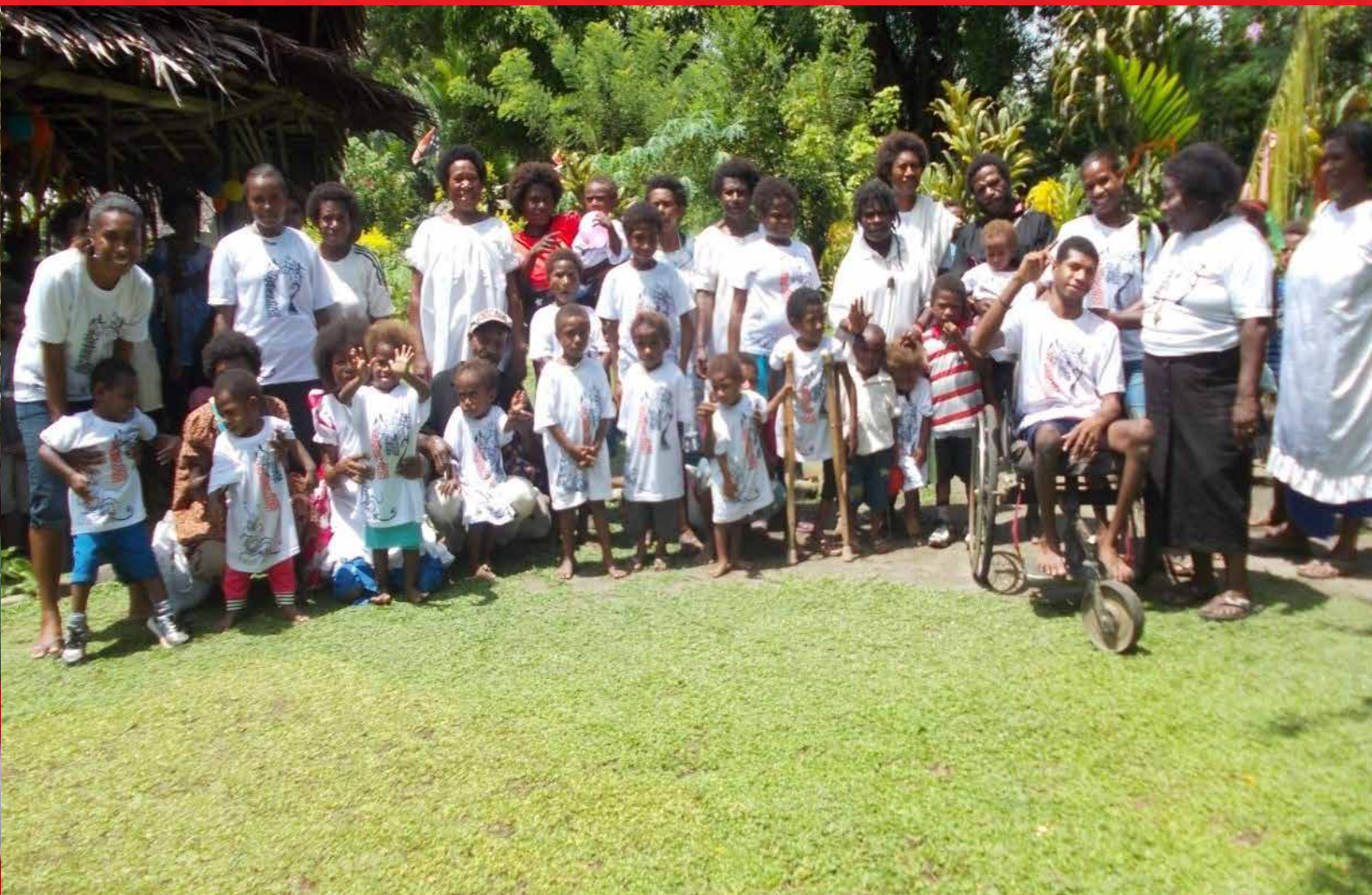
Parents and caregivers of children with disabilities celebrate World Children's Day in Wewak, East Sepik Province.

We believe in creating an inclusive and equal society that gives opportunities to all people, including those living with disabilities and special needs