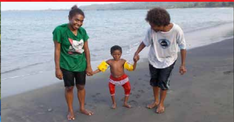
Community Based Rehabilitation clients in Wewak receive awareness and therapy from the Callan Special Education Resources Centre field workers.

The Community Based Rehabilitation Program was piloted in 2013 and the successful implementation of the program led to the continuation of the program.