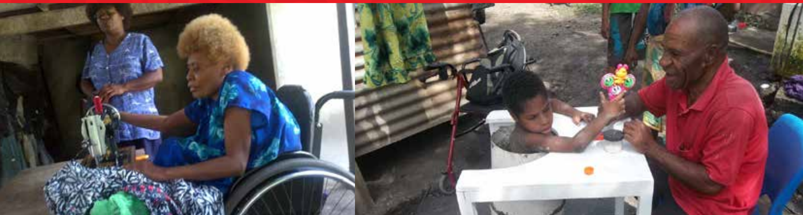
Ilam Kiniguda and Tally Kanida are two clients benefitting from the CBR program in Kokopo & Port Moresby.