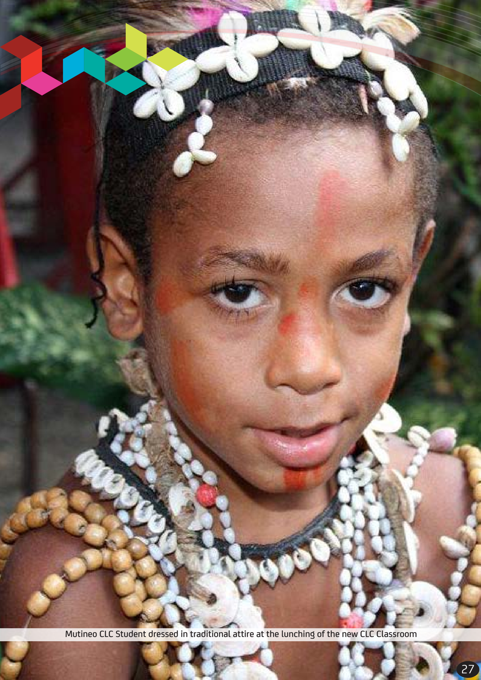
Mutineo CLC Student dressed in traditional attire at the lunching of the new CLC Classroom