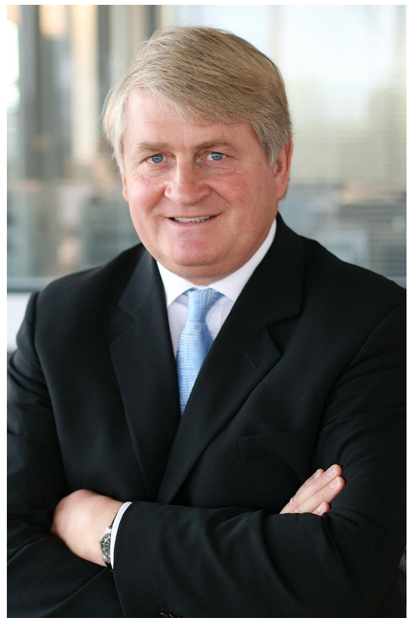
Denis O'Brien Founder and Patron, Digicel Foundation