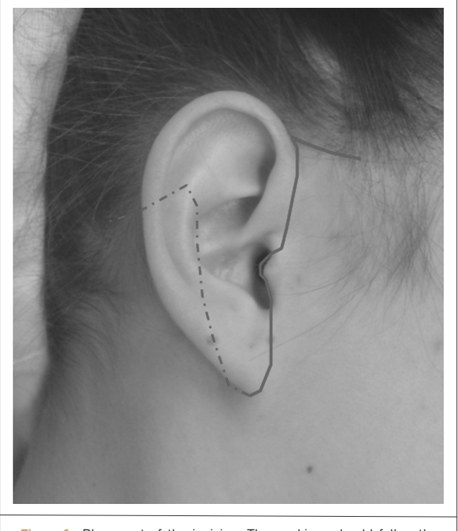
Figure 1 Placement of the incision. The markings should follow the natural curves of the ear. In both men and women, a retrotragal incision is used, except for smokers in whom a pretragal incision is utilised.

Modified tumescent solution (1000 mg normal saline mixed with 100 ml 1% xylocaine plain and 2 mg epinephrine) is infiltrated into all operative areas with a No. 20 gauge needle. Approximately 30–50 ml is used per side. The same tumescent