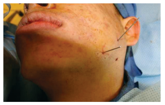
Fig. 2. Placement of percutaneous Kirschner wires for plate stabilization of a left mandibular angle fracture is shown.

placed across the superior border of the fracture. No fluoroscopic visualization was needed, as all maneuvers were performed under direct visualization. The gingiva was closed to achieve a watertight seal.