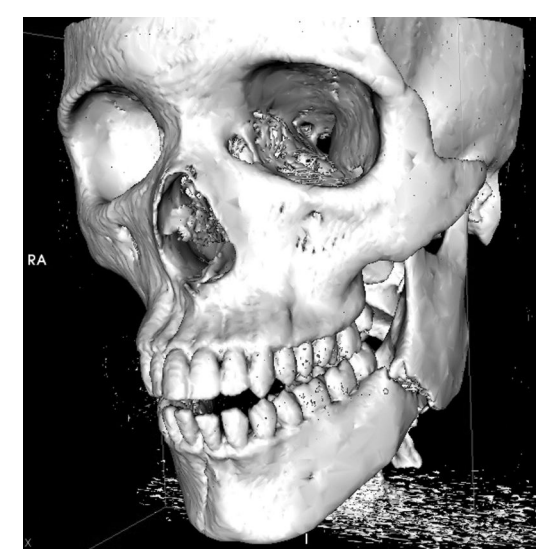
Fig. 1. Computed tomographic scan showing displaced mandibular angle fracture of a patient who subsequently underwent repair with the Kirschner wire plate stabilization technique.