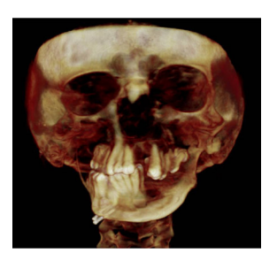
FIGURE 4. A three-dimensional reconstructed radiograph of a high-resolution computed tomography scan demonstrates a left paramedian mandibular cleft and mandibular hypoplasia.

Debate also surrounds the timing of reconstruction. Depending on the severity of the clefting, delayed closure of the mandibular defect until 8 to 10 years of age has been suggested. 11,12 Reconstruction, at the age of mixed dentition, offers the advantage of reduced risk of damage to the tooth buds. Proponents of earlier correction, however, cite the need to ameliorate the severe malocclusion that often accompanies these clefts. Interestingly, successful correction of bony mandibular defects has been reported as early as 20 months of age. 17