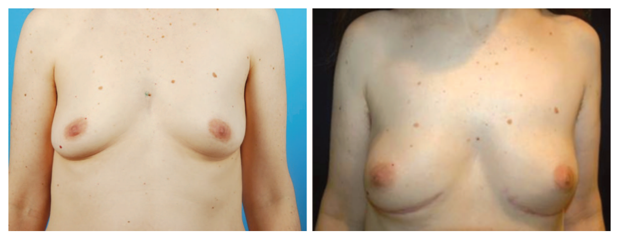
Fig. 3. ( Left ) Preoperative view and ( right ) postoperative appearance after bilateral nipple-sparing mastectomies and immediate deep inferior epigastric artery perforator flap reconstruction.