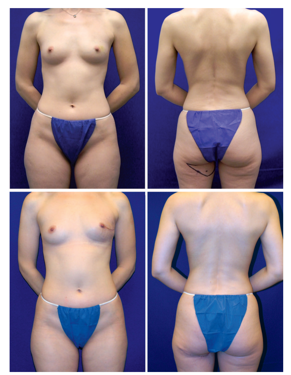
Fig. 2. ( Above ) The patient is shown before left prophylactic nipple-sparing mastectomy. ( Below ) Patient's appearance 1 month after immediate reconstruction with a left profunda artery perforator flap.

Mastectomy skin flap necrosis can be a challenging postoperative complication to manage. In this series, there were 11 autologous reconstructions (12.7 percent) complicated by ischemia and necrosis of the mastectomy skin envelope. These occurred early in the study period as the surgical team gained experience with nipple-sparing mastectomy. For institutions embarking on nipple-sparing mastectomy, this issue requires careful consideration. If there is an in-