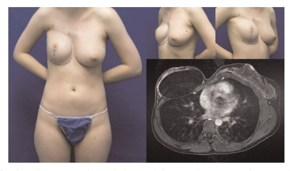
Fig. 1 ( Left, top left, and top right ) Preoperative photographs showing right breast capsular contracture and asymmetry. ( Bottom right ) Preoperative magnetic resonance images displaying muscle hypoplasia and absence of ribs. Note the chest wall concavity and excursion of the implant.

measured 5 feet and 4 inches tall, with only minimal abdominal adipose tissue. At the age of 18 years, she had undergone breast reconstruction with a tissue expander and subsequent saline implant placement filled to 320 cc, later on developing Baker grade IV capsular contracture, significant asymmetry, and pain ( ¬Fig. 1 ). The nipple on the right was approximately 5 cm higher than the one on the left. Her left breast was normal and she wore a C-cup bra.