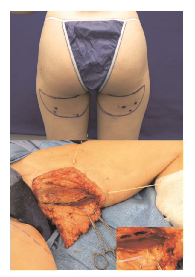
Fig. 3 ( Top ) Preoperative photograph demonstrating outline of bilateral profunda artery perforator (PAP) flaps and the location of the perforators. ( Bottom ) Intraoperative photograph of PAP flap harvest from the left leg. The dotted line represents the medial edge of the gracilis muscle. The marker points to the perforator. ( Inset ) Magnified view of the perforator dissection.

can provide long-lasting, cosmetically pleasing results while avoiding many of the complications associated with implants, such as contracture and infection.<sup>4</sup> Although a variety of abdominal flaps can be used for this purpose, many patients lack the volume of tissue to achieve a symmetrical reconstruction. The recently described PAP flap is a nonabdominal source of tissue for breast reconstruction, although its volume is limited. In this case report, we have described the first report of using stacked PAP flaps for larger volume unilateral breast reconstruction.