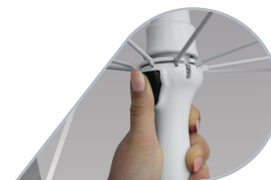
Ergonomic runner hub and release button.

— Optional 20 litre white water-fillable base.