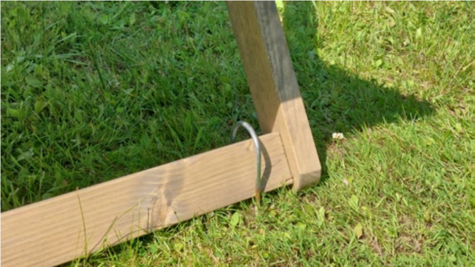
Pic 4. Securing the deckchair using ground anchors