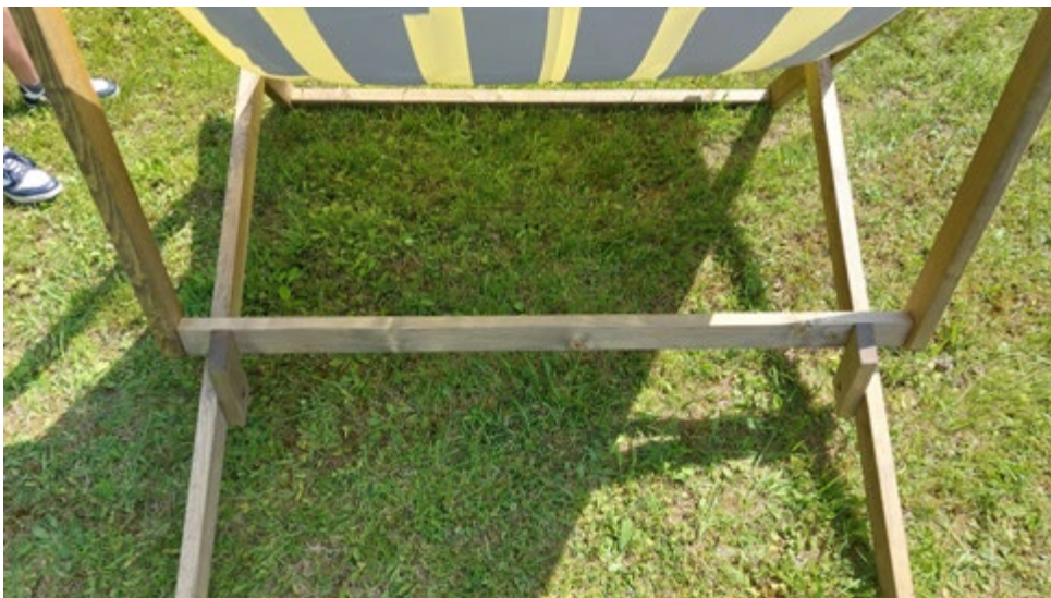
Pic 5. Correct installation of the deckchair position stoppers.

The deckchair position must be secured with ground anchors or weighted bags (anchors and weight are not included in the set) (Pic. 4)