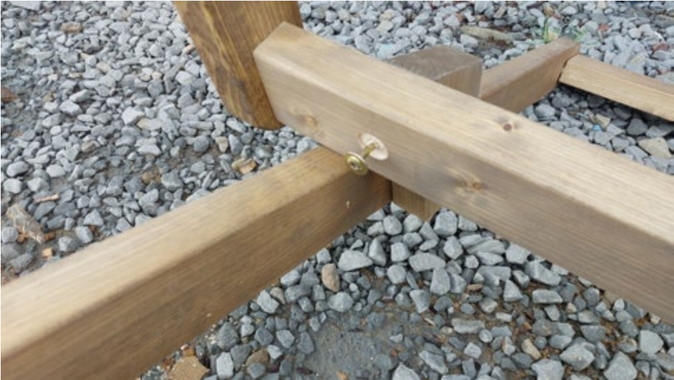
Pic 3. Beam no. 3 must be securely fixed to the stoppers using 4.5 × 80 mm screws.