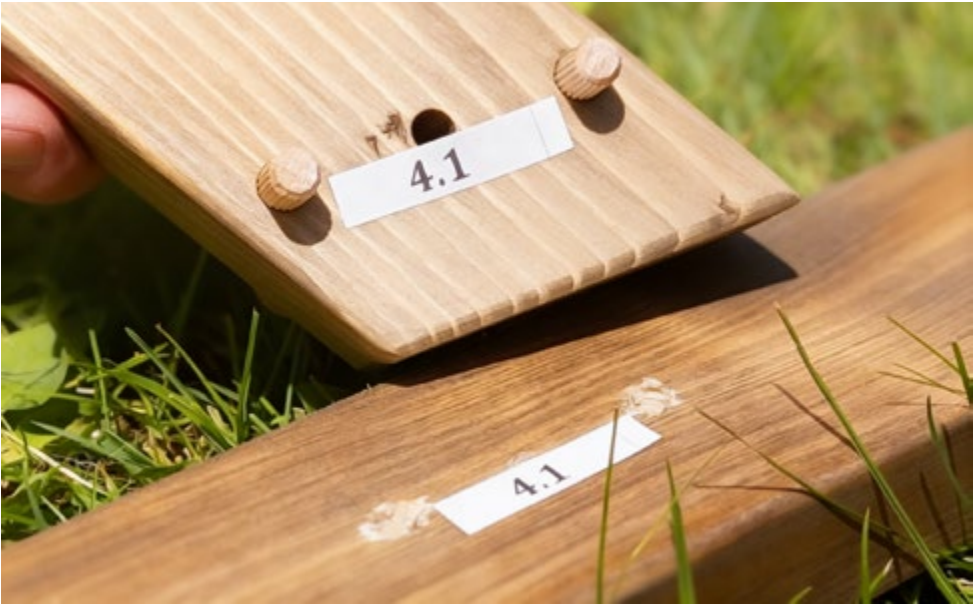
Pic 2. Each end of the beam is marked to indicate its correct position on the frame.