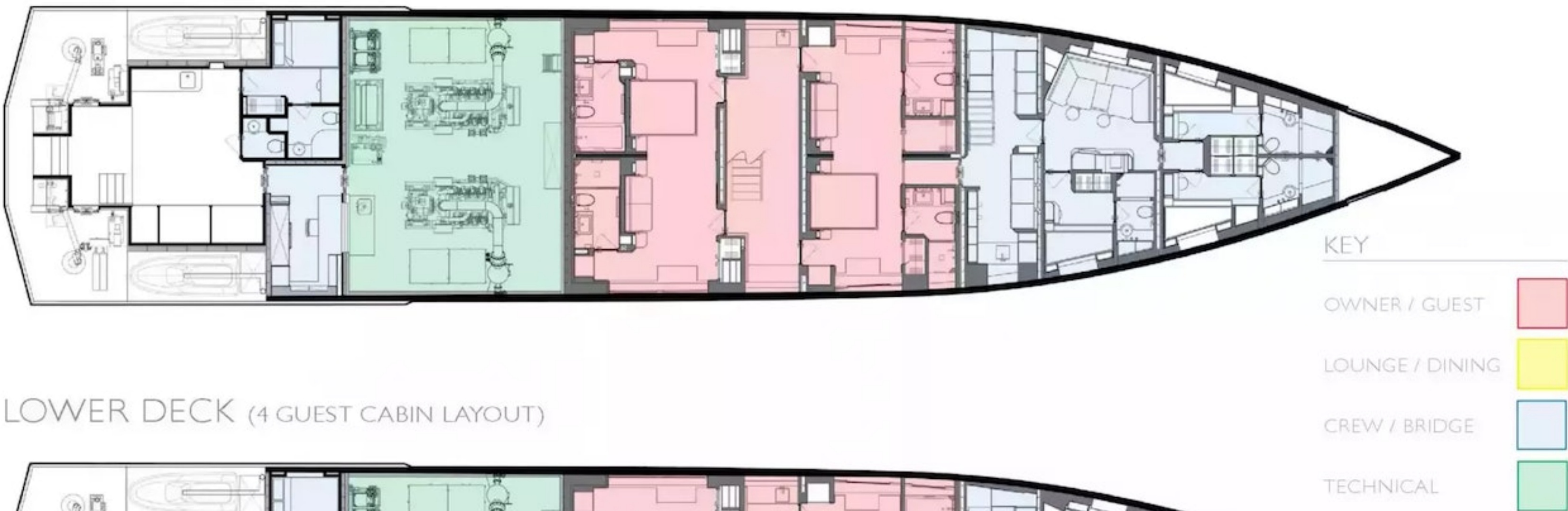
LOWER DECK (4 GUEST CABIN LAYOUT)