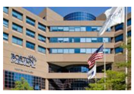
Newton Pavilion - 88 East Newton St