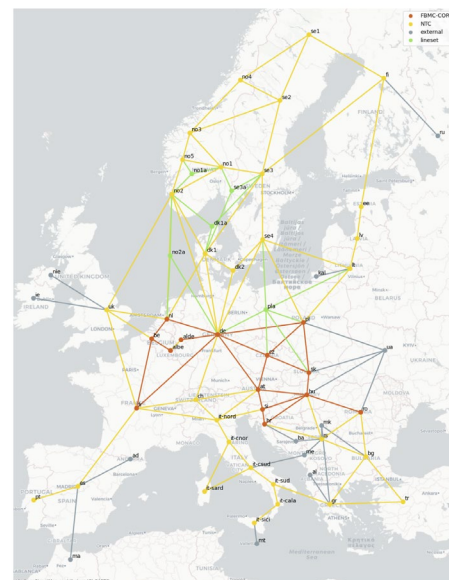
European network topology

Our speedy and reliable API allows you to retrieve data in real-time, and our in-house weather-driven intraday forecasts are updated continuously.