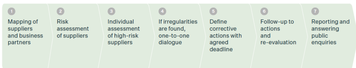
Figure 5: Volue’s approach to comply with the Transparency Act

In addition to an enhanced supplier management process implemented in Volue’s quality system in 2024, Volue follows a seven-step approach for supplier risk assessment in accordance with the yearly compliance calendar. These steps will be elaborated upon and clarified in this document, with a continued focus on their implementation beyond the release of this report.