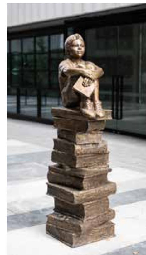
'Between Innings' by Greg Lee Price

'Between Innings' by Gary Lee Price is a 6 foot tall sculpture located at the Theatre end of Lyric Lane. Sourced from the United States, the bronze sculpture is a depiction of a child sitting on a stack of books reading. The sentiment is 'knowledge is power - the more knowledge we obtain, the more choices we are free to make and the more empowered we become'.