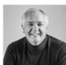
Paul Polman Business leader, campaigner, co-author of Net Positive, Former CEO, Unilever