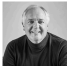
Paul Polman Business leader, campaigner, co-author of Net Positive, Former CEO, Unilever