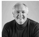
Paul Polman Business leader, campaigner, co-author of Net Positive, Former CEO, Unilever