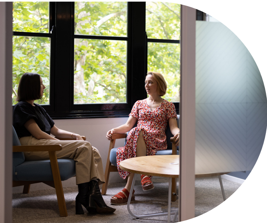
Domain office, Sydney. GreenPower customer.