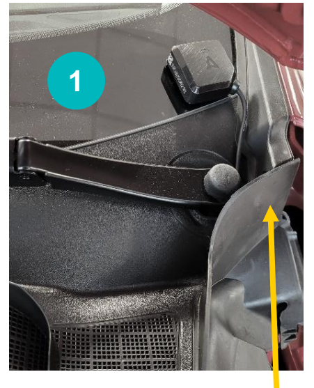
Make sure that the cable goes between the soft material.