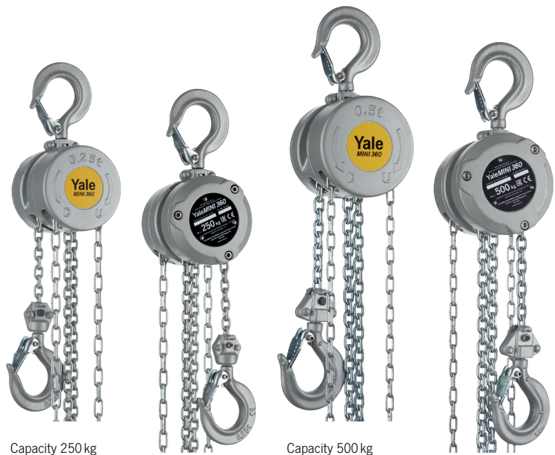
Capacity 250 kg