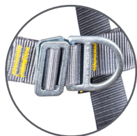
Front attachment point