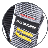
Rip stitch indicators