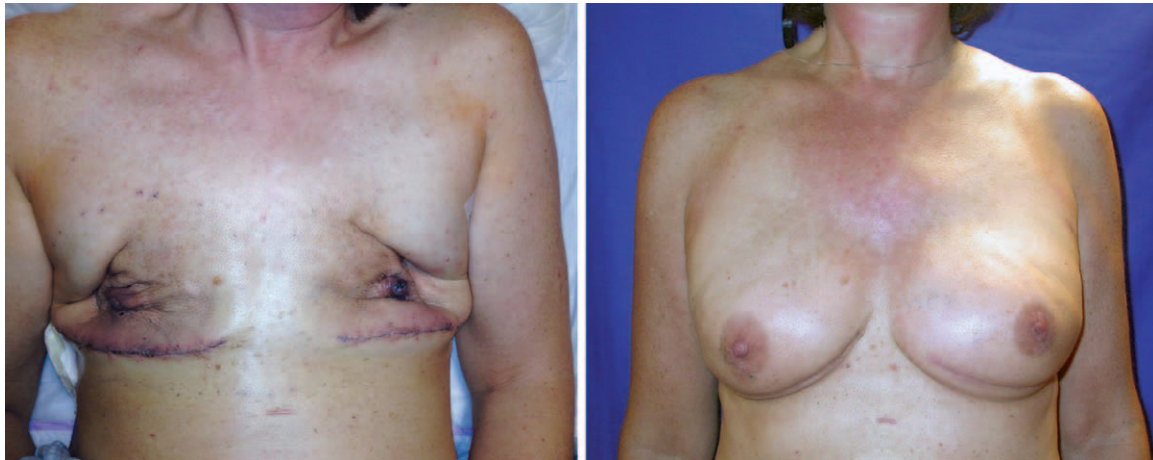
Fig. 3. (Left) A 58-year-old woman is shown on postoperative day 1 after nipple-sparing mastectomy via an inframammary fold approach. The skin flaps under laser angiography looked so poor that no implants or expanders were placed. Her ischemia is obvious even to the naked eye. She returned to the operating room on postoperative day 15 and had acellular dermal matrix slings and final implants placed. (Right) The patient is shown at her 2-month follow-up visit. Note that by using this conservative approach, no skin or nipple tissues were lost and her implants were placed without tissue expansion.

malposition. In the appropriately selected patient, I prefer to place the final implant at the time of nipple-sparing mastectomy and utilize laser angiography to guide that decision process. These patients generally are smaller breasted (C cup or less), have little ptosis (grade I or II), are not smokers, have never had radiation to the breast, and have no scars from previous surgery. Patients who do not fit into these categories are generally at higher risk for necrosis and are either not offered immediate reconstruction or are staged with expanders or other procedures.