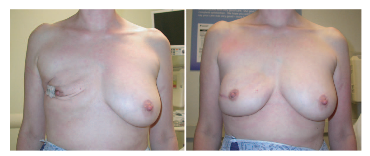
Fig. 2. ( Left ) A 51-year-old woman is shown 13 days after a lateral approach to nipple-sparing mastectomy. She will now undergo placement of an acellular dermal matrix sling and her final implant. ( Right ) At 9 months postoperatively, nipple projection and position have been maintained.