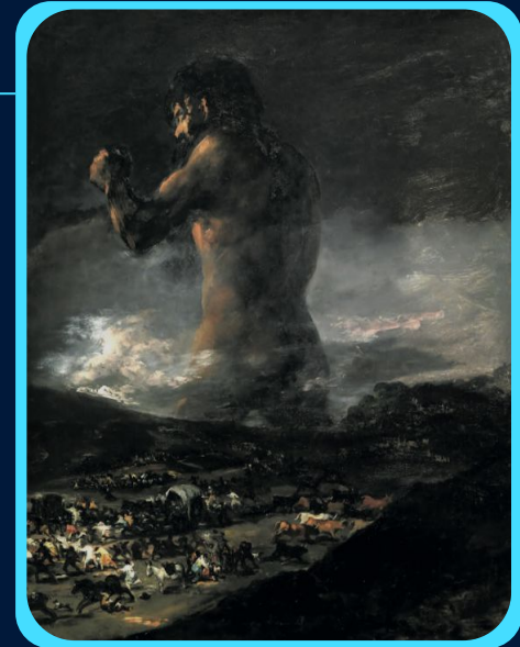
Figure: Francisco de Goya, El Coloso, Copyright Museo Nacional del Prado

Nobel Lecture in Economic Sciences-December 8, 2018